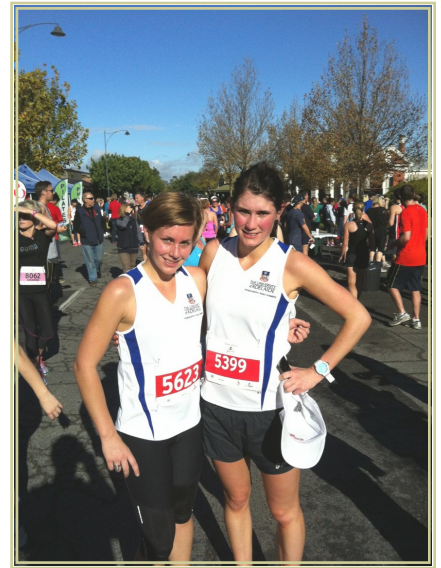
Barossa 10km Run