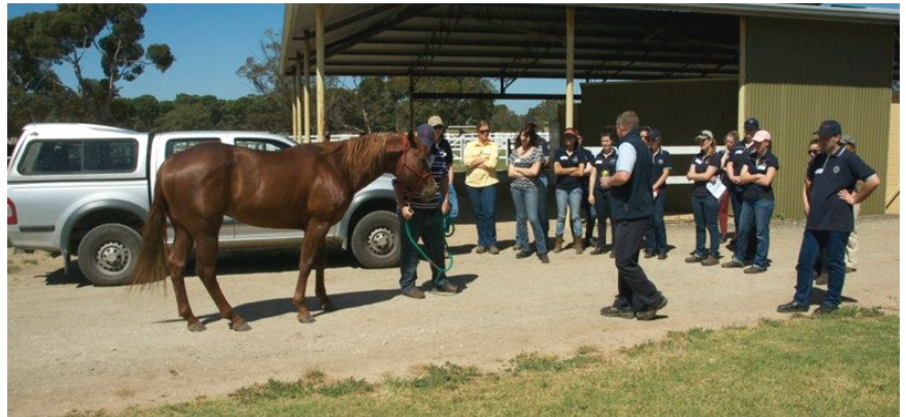
Students at the 2012 Hoof Care Day