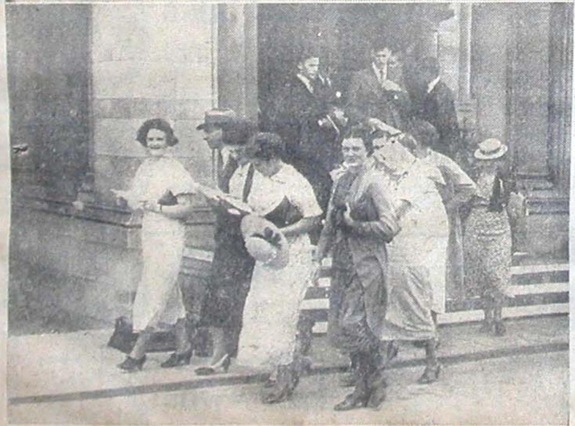
SEVERAL HUNDREDS of students at the Adelaide University began degree and diploma examinations yesterday. Photograph shows groups of them leaving the main building after tackling weighty problems.