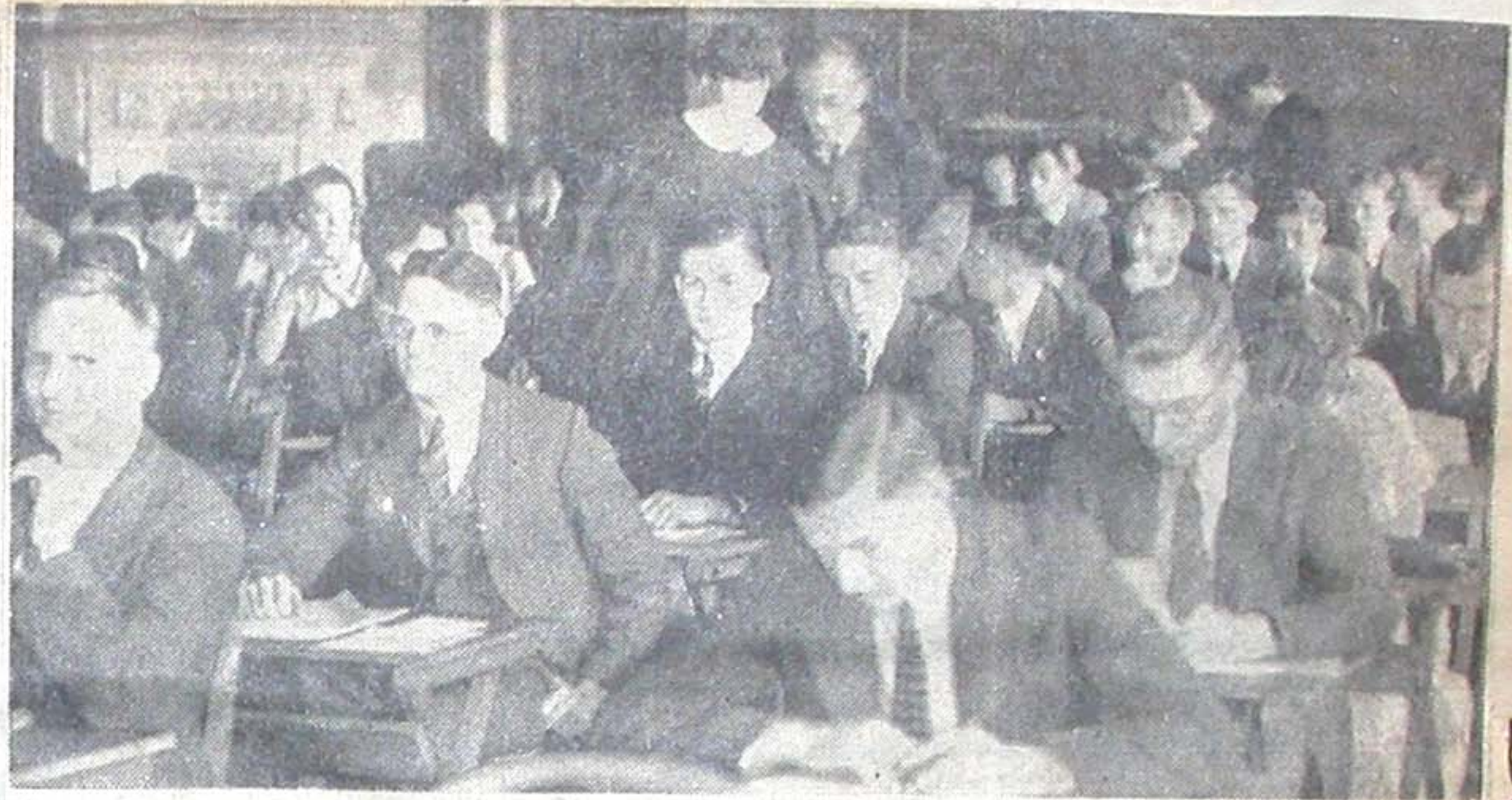
SIX HUNDRED STUDENTS sat today for the first of the degree and diploma examinations at the University. Some of the candidates seated at their desks waiting for the distribution of examination papers at 9.30 a.m.