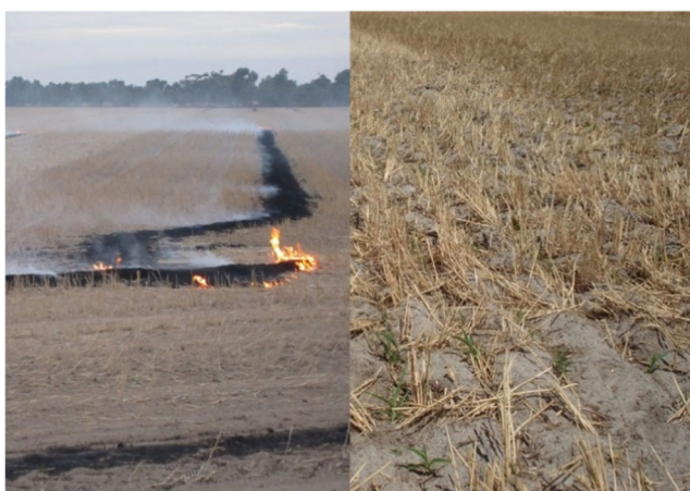
Fig. 1 Stubble burning ( left ) is a source of greenhouse gas emissions to the atmosphere, while stubble retention ( right ) is an option for greenhouse gas abatement

projects must meet certain criteria. The Emissions Reduction Fund works as a “reverse auction” scheme, where participants can bid with their abatement projects, and quantify the amount and price of abatement they are prepared to deliver. The government enters into contracts with proponents of bids below a benchmark price (not revealed to the public). At the time of writing, three auctions had been held under this policy (in April 2015, November 2015, and April 2016), with an average per metric ton CO 2 e abatement price of $13.95, $12.25, and $10.23, respectively (Clean Energy Regulator 2016a).