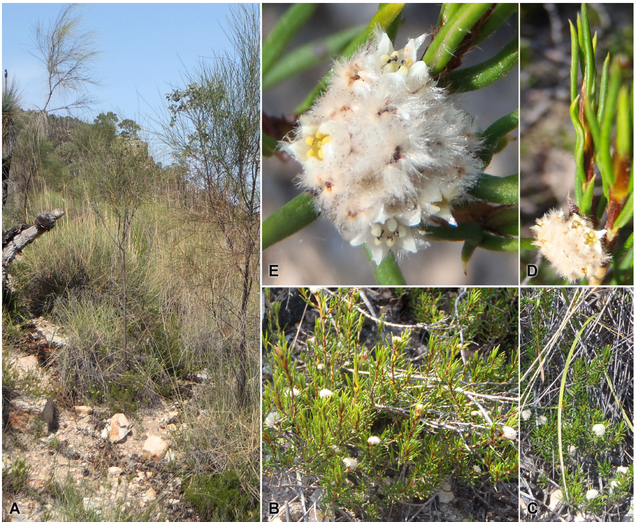
Fig. 5. Spyridium undulifolium at the type locality, a rocky hillside above Wollar Road, New South Wales. A Plants growing below spinifex ( Triodia scariosa ); B habit when growing in the open; C plant growing in and protected by spinifex; D flower-head and new growth with wavy young leaves; E close-up of flower-head.