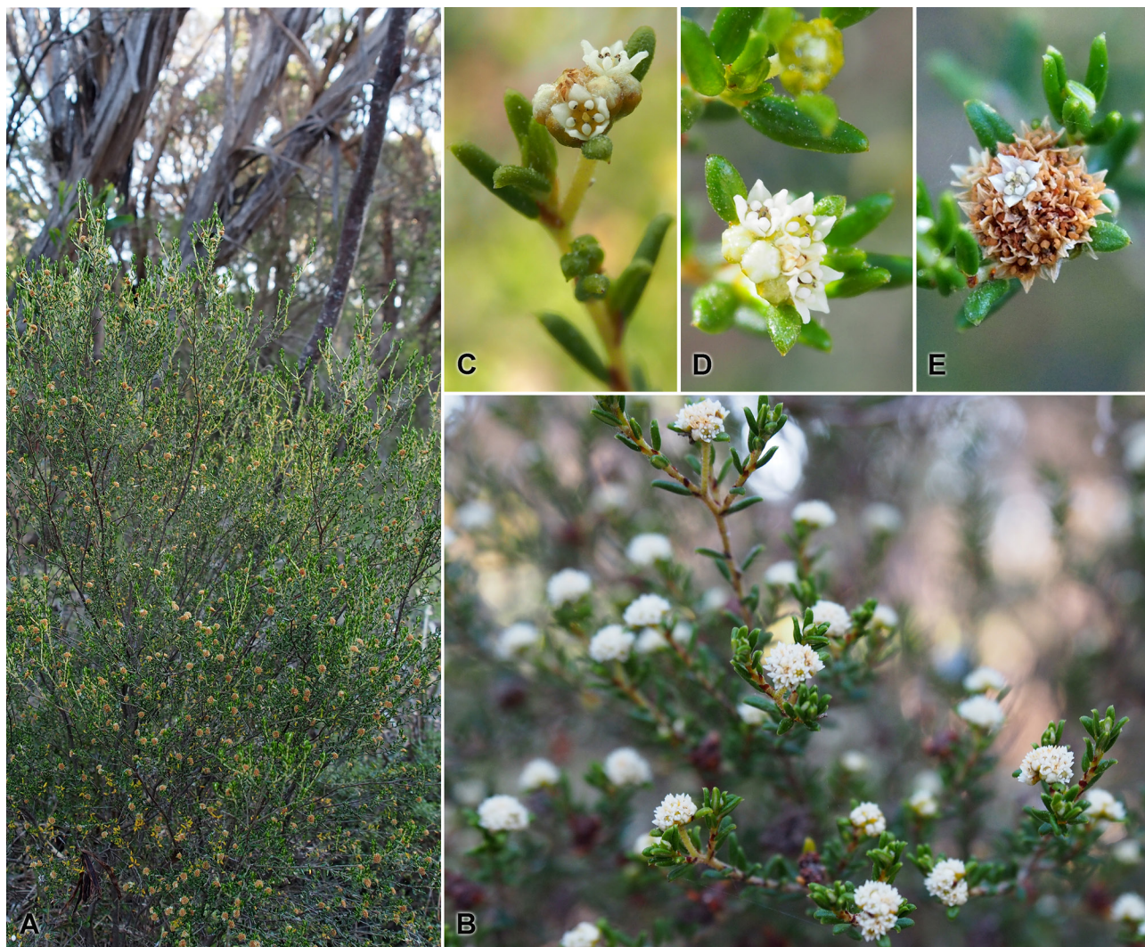
Fig. 2. Spyridium glabrisepalum . A Plant growing near Playford Hwy, Kangaroo Island; B flowering branches; C, D young flower-heads; E older flower-head. — A, B, E T.S. Te 1238; C D.J. Duval 3560;