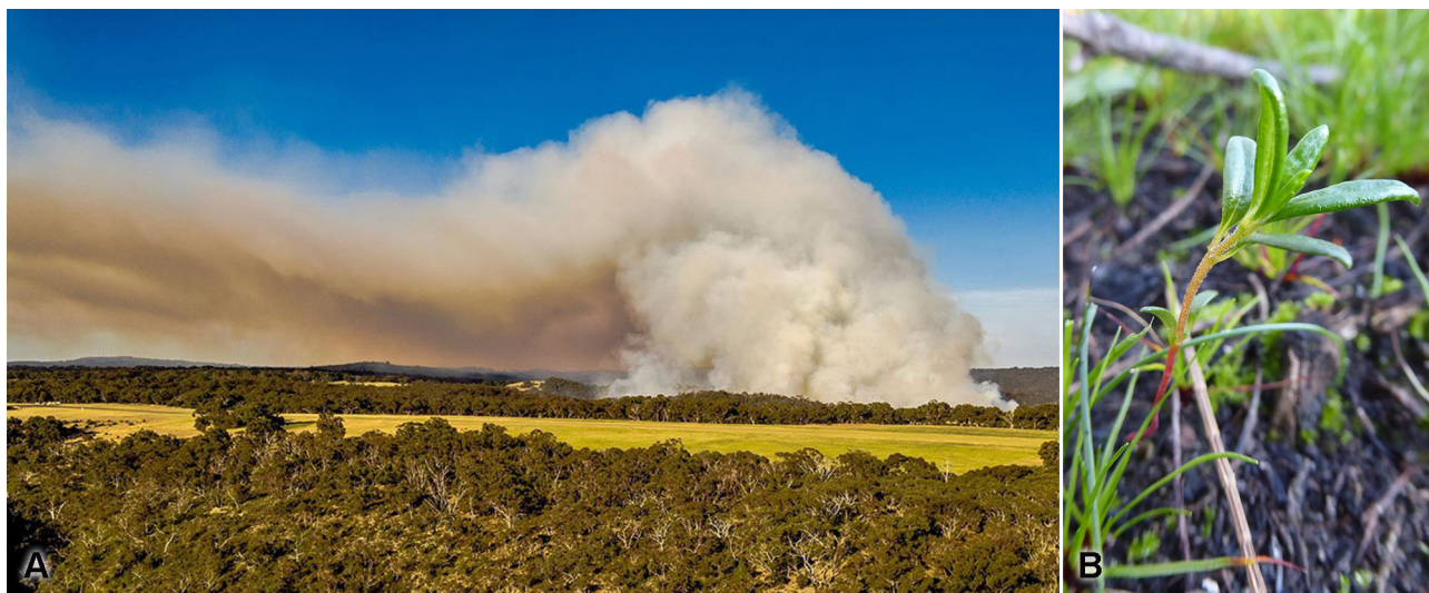
Fig. 4. A The controlled burn in part of Bullock Hill C.P., the type locality (3 Nov. 2020). B Seedling of Spyridium latifolium in the recently burned area (27 Aug. 2021). — B J. Kellermann 1011 & L. Williams.