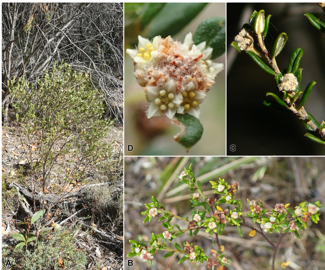
Fig. 3. Spyridium latifolium at Bullock Hill C.P., the type locality (A, C, D), and Winery Road Reserve (B), Fleurieu Peninsula, South Australia. A Habit; B flowering branches; C twig with older inflorescences; D close-up of flower-head. — B J. Kellermann 661 & F. Nge, D JK 653 & FN.

Distribution & habitat. This species occurs in the south-east of the Mt Lofty Ranges in the area between Strathalbyn, Goolwa and Victor Harbor, South Australia, in dense scrub and mallee woodland with a heathy understorey on sand and loamy sand (Fig. 7).