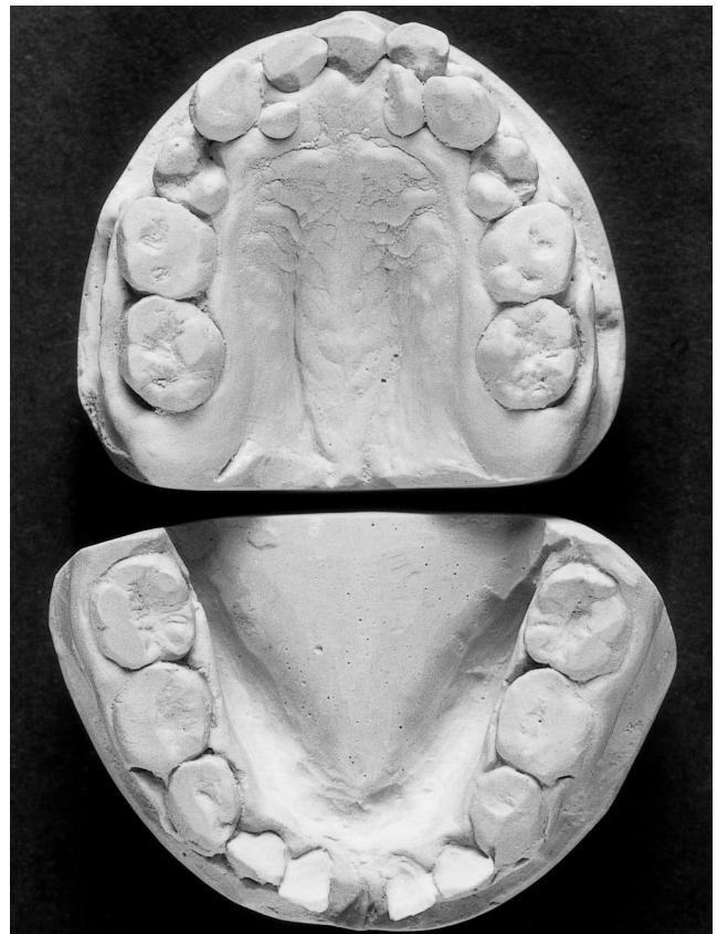
Fig 3. Example of attrition in Down syndrome. Dental models of a 12-year-old girl with Down syndrome exhibiting pathological attrition due to day-time bruxism. The attritional lesions are particularly evident on the buccal cusps of the mandibular molars and incisal edges of maxillary incisors.

children placed in either Group C or D (pathological wear) and 34.7 per cent with very severe tooth wear (Group D). Comparison of the severity of tooth wear in Down syndrome children and non-Down syndrome children is depicted in Fig 1. Tooth wear (Groups B, C and D) was significantly more frequent ( p < 0.001 ) in the Down syndrome than the non-Down syndrome sample (67.4 cf 34.7 per cent). In addition, a significantly greater number of Down syndrome children ( p < 0.001 ) exhibited severe to very severe wear in comparison to non-Down syndrome children (59.2 cf 8.2 per cent).