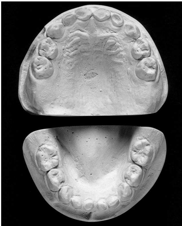
Fig 4. Example of erosion in Down syndrome. Dental models of an 8-year-old boy with Down syndrome presenting with pathological erosion due to frequent consumption of carbonated drinks. Cupped lesions are most evident on the anterior teeth.

correlation was found between the severity or perceived aetiology of tooth wear and diet acidity.