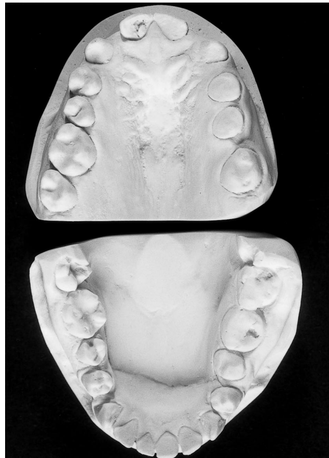
Fig 5. Example of tooth wear of multifactorial aetiology in Down syndrome. Dental models of a 15-year-old boy with Down syndrome demonstrating unilateral abrasive tooth wear on the left side due to habitual gripping of an object in the mouth, superimposed with erosion due to a combination of acid reflux and dietary sources.

Reports of pain were generally low. Most of the parents stated that their child would not tell them if they were in pain, or said that their child could not talk. Parents stated that 2.9 per cent of Down syndrome children reported pain in facial muscles, 8.6 per cent in the temporomandibular joints and 5.7 per cent in jaw muscles. 11.4 per cent of children complained of headaches and 5.7 per cent woke in the morning with a headache. Medications that induce xerostomia were taken by 31.4 per cent of Down syndrome children,