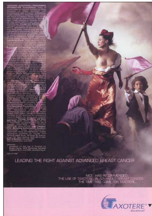
Fig 3 Taxotere: “Leading the fight against advanced breast cancer”

An industry award winner in 2001, this example (fig 3) prompted debate in the BMJ about what some saw as inappropriate eroticism. 17 It is a tableau of Delacroix’s Liberty Leading the People (fig 4). Pink silk flags substitute for sabres, muskets, pistols, and tricolour in the original painting to evoke the pink ribbons of the (drug industry sponsored) breast cancer awareness campaign. It