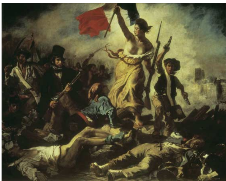
Fig 4 Liberty Leading the People by Eugène Delacroix, 1830, in the Musée du Louvre, Paris

In law and science, words are precise and accountable, justified by evidence. In advertising, the image is ambiguous and unaccountable. It makes its "killing" (an aggressive metaphor for selling) softly. Thus we arrive at the very principle of myth: to transform history into nature. 15 Associations between diseases and drugs are made to seem natural, unmotivated by commercial interest. The manifold couplings conveyed in the Aprovel advert show the principle well. Its administration for hypertension seems as natural as kissing, bathing, and other variations on a coupling theme. Condition and brand are presented as belonging to a higher logical order of things that belong to each other. To naturalise is also to neutralise or "dis-interest" the intention to promote.