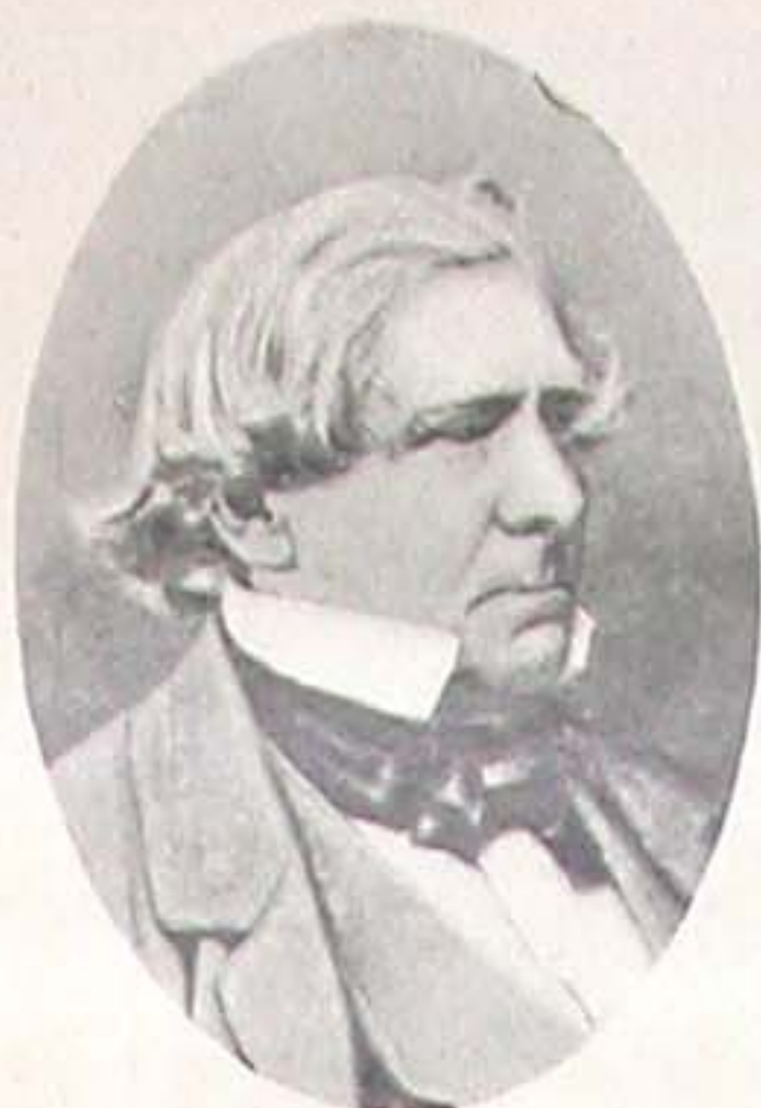
MR. WILLIAM CHARLES WENTWORTH, To whose efforts the establishment of the University was mainly due.