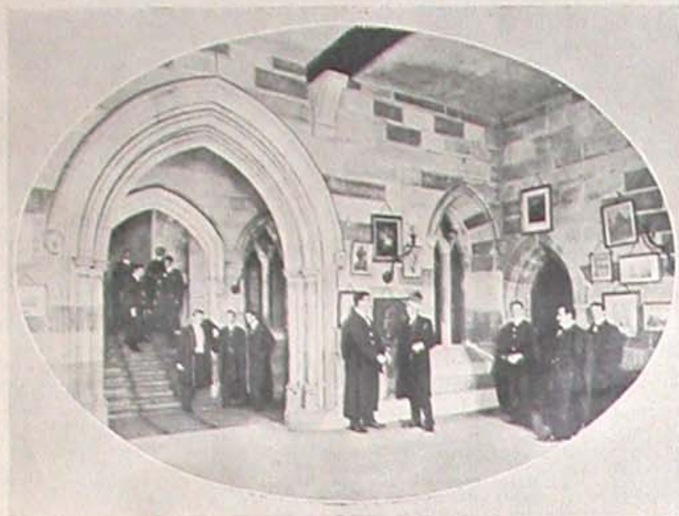
ENTRANCE TO ST. JOHN'S COLLEGE.