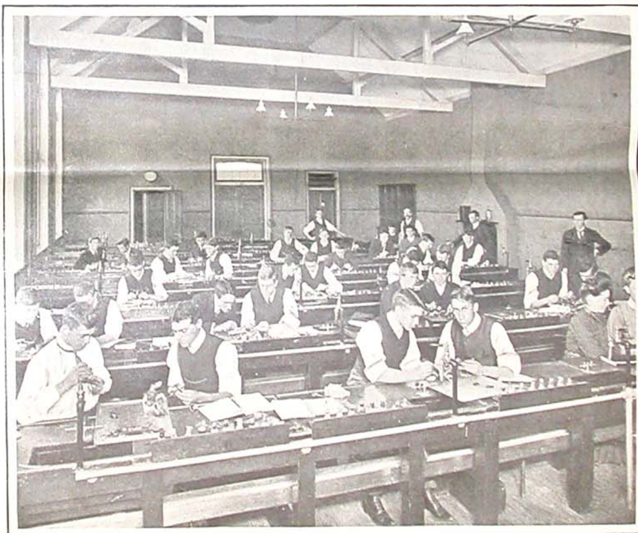
BIOLOGICAL STUDENTS AT WORK DISSECTING PIGEONS.