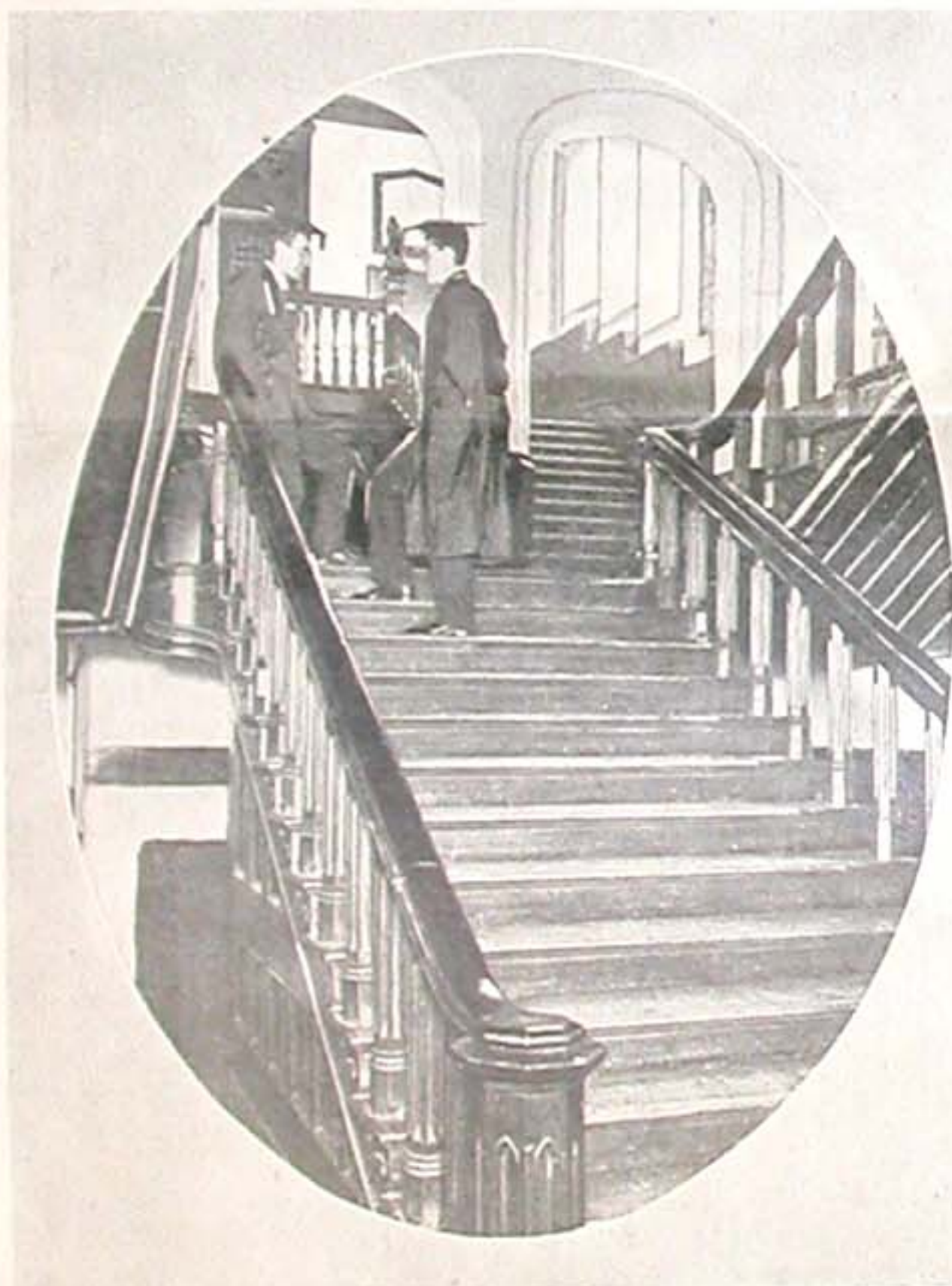
STAIRCASE, ST. ANDREW'S COLLEGE.