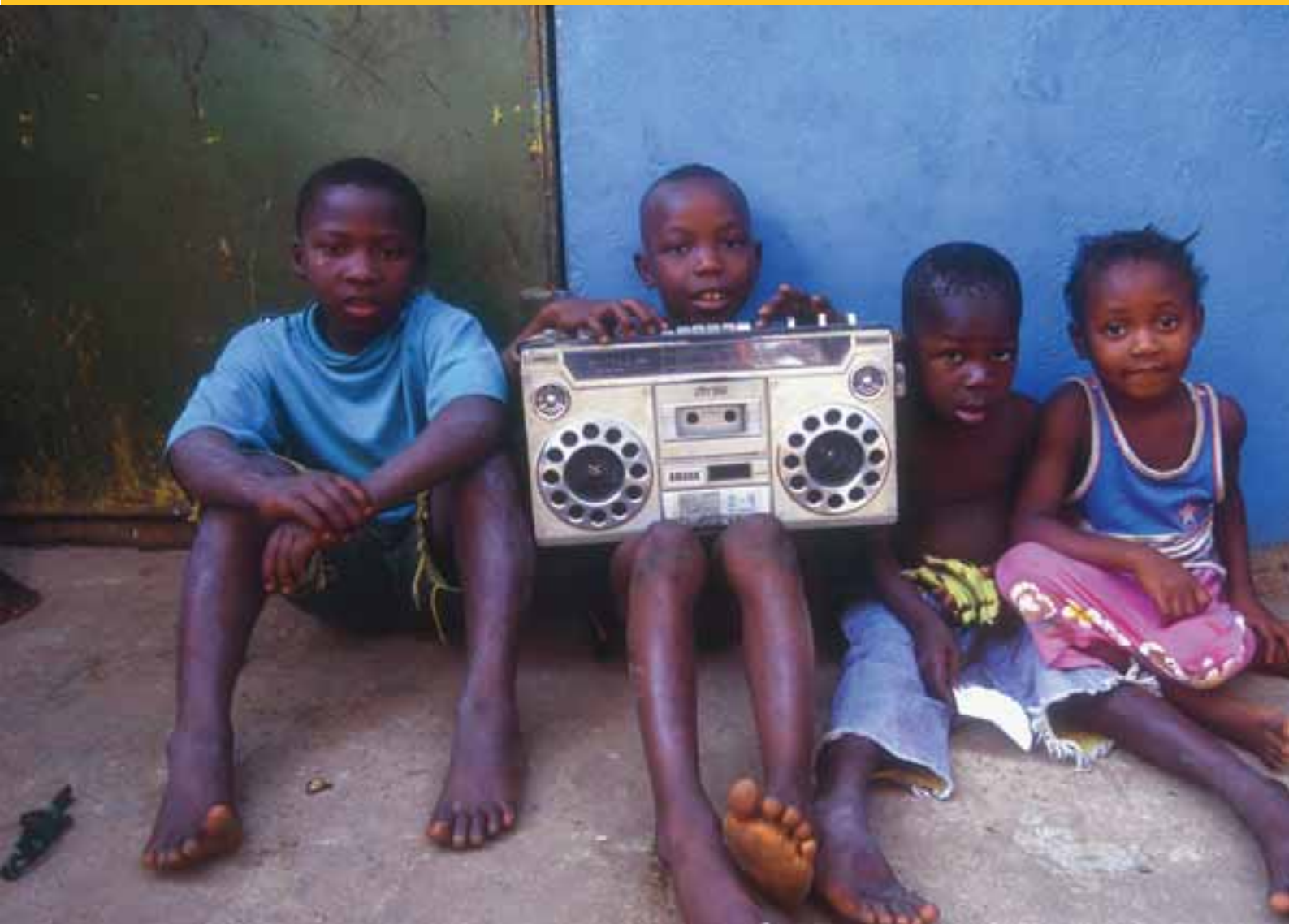
SIERRA LEONE Kids listening to the radio.