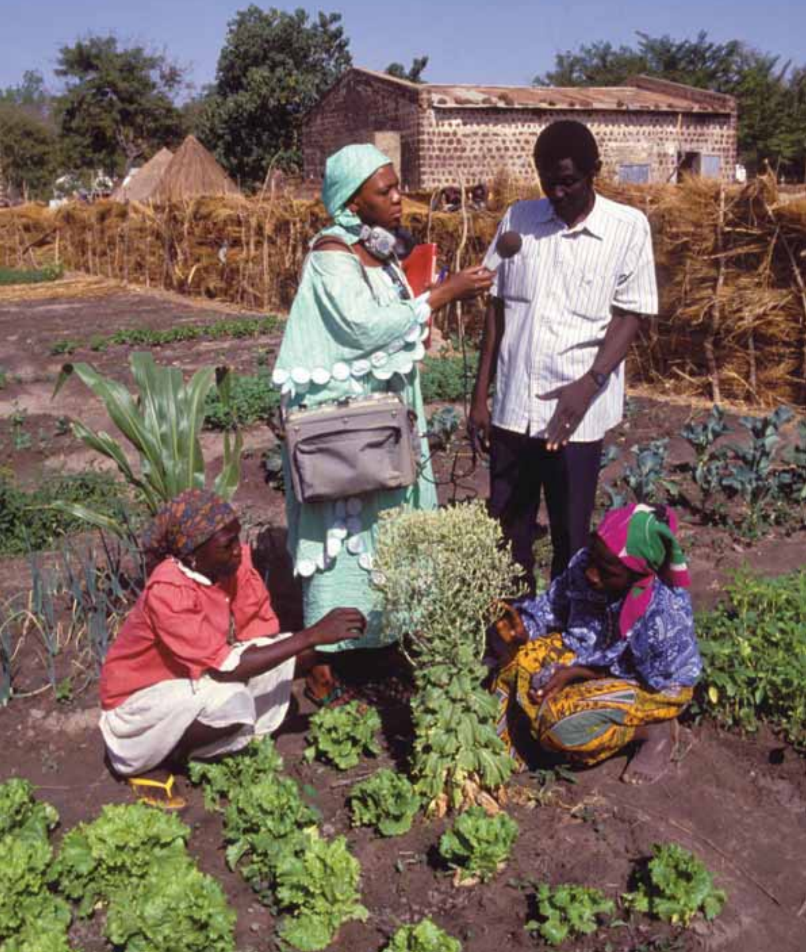
CHAD Community radio: interviewing subsistence farmers.