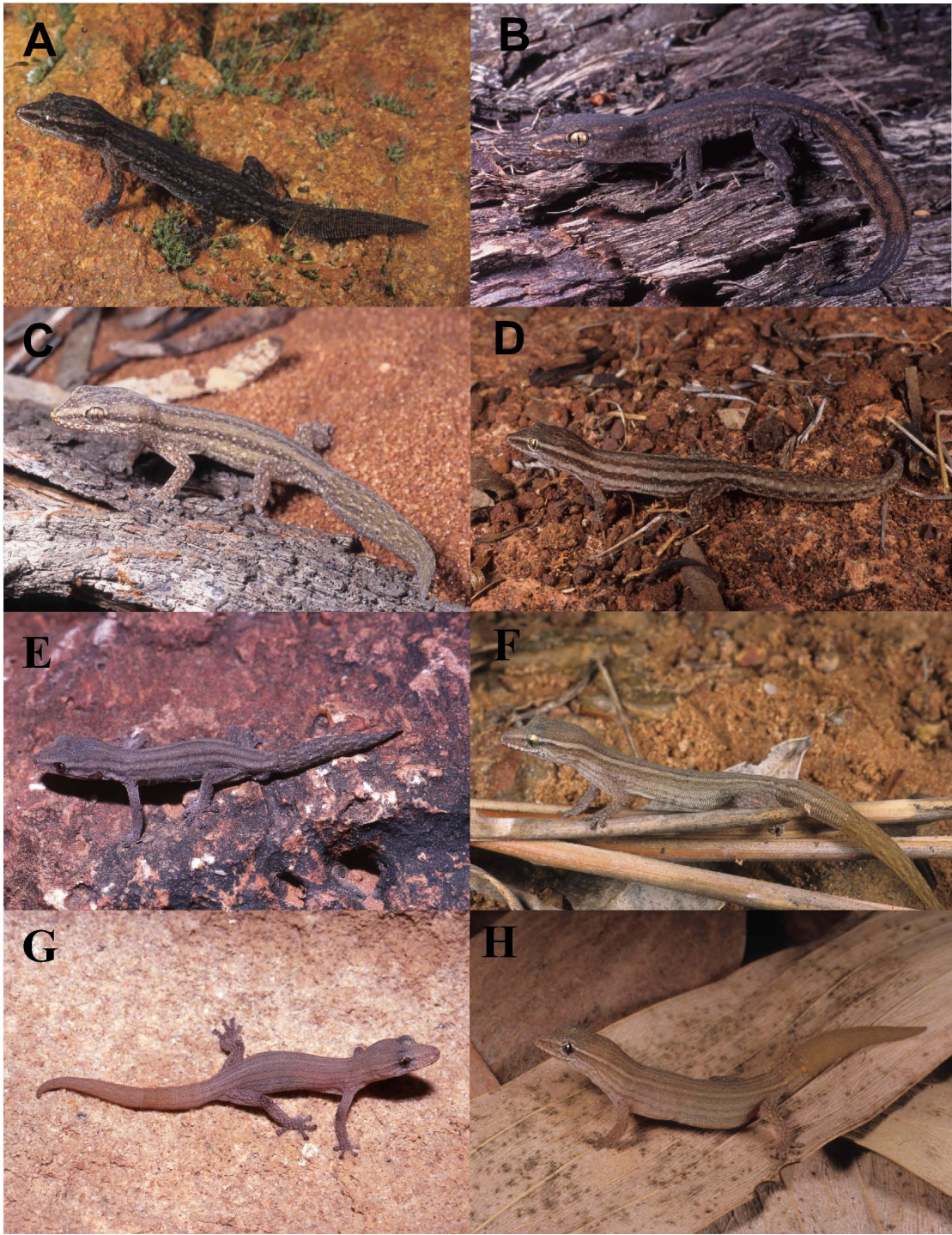
Figure 3 Candidate species of Crenadactylus . Pictures in life of 8 of the 10 candidate species currently confounded within the nominal species Crenadactylus ocellatus A) South-west B) Carnarvon C) Cape Range D) Pilbara E) Central Ranges F) Kimberley B G) Kimberley D and H) Kimberley E.