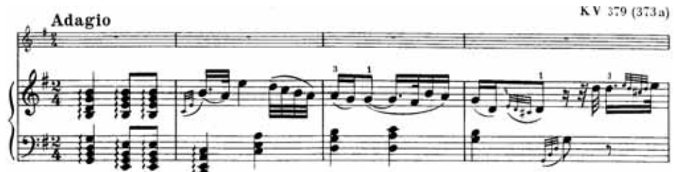
Ex. 10: Mozart, Sonata for Piano and Violin in G, K 379, 1st movement, bars 1–4

The majestic nature and unusually thick scoring of the arpeggiated chords in the opening solo piano passage in the Mozart Sonata in G for piano and violin, K 379 suggests the use of the pedal (see Ex. 10). Legato-pedalling was not employed as a standard technique until well into the nineteenth century; the music simply did not require legato-pedal changes. Due to the limited resonance of the Stein piano it was actually possible, in performance, to pedal through three different harmonies without causing intolerable blurring.