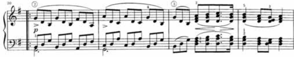
Ex. 95: Schubert, Moments musicaux no. 1, bars 30–33

The trio section reveals a different texture (see Ex. 95), and here I used the pedal throughout all bars with a broken chord accompaniment to ‘collect’ the harmonies. This also had the effect of binding the right hand melodic line in bars 30–32, which is written in a similar texture to Voříšek’s Impromptu no. 4 (see Ex. 82).