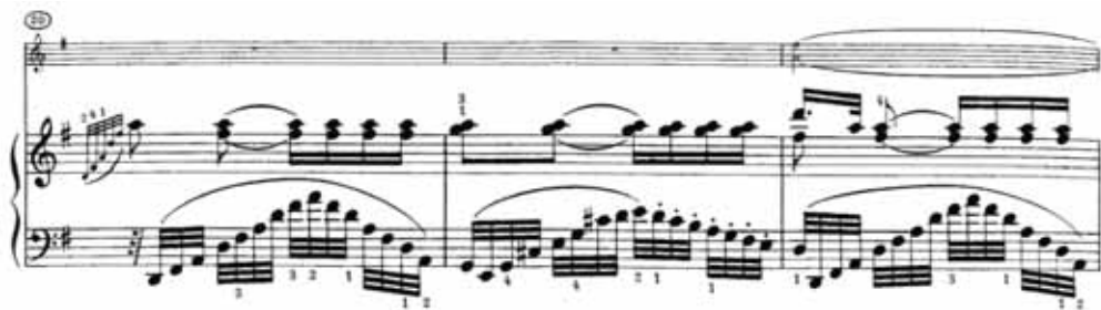
Ex. 11: Mozart, Sonata for Piano and Violin in G, K 379, 1st movement, bars 20–22

Similarly, the solo piano passage beginning at bar 20 (see Ex. 11), relies on the use of pedal to create a full, 'orchestral' sound. The unusual, sweeping slurs in the bass were perhaps Mozart's way of indicating this; certainly it is impossible to play this passage convincingly without the pedal.