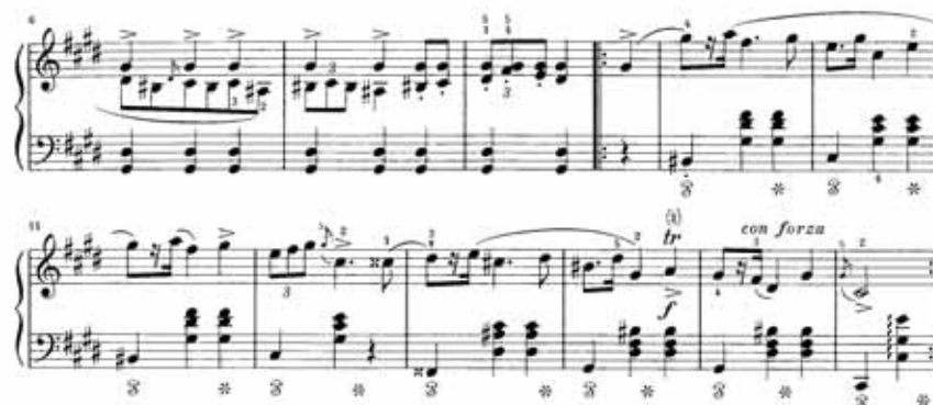
Ex. 134: Chopin, Mazurka, Op. 6, no. 2, bars 6–16

Meniker, Chopin's use of slurs "is based on and is an extension of, their use in the Classical tradition from which his musical education sprang." 118