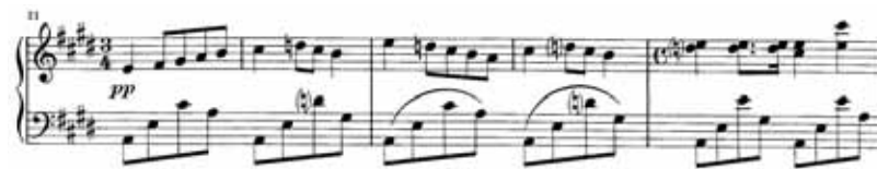
Ex. 122: Chopin, Nocturne in C sharp minor, Op. posth, bars 21–23 (autograph version) 111

This is particularly apparent in the bars 21–22 of the Chopin Nocturne in C sharp minor Op. posth. (see Ex. 122).