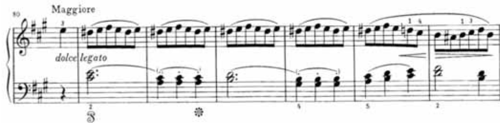
Ex. 40: Field, Sonata in A, Op. 1, no. 2, 2nd movement, bars 80–85

The only pedalling actually notated in this movement comprises longer, atmospheric pedal markings over two or four bars (see Ex. 40). This pedalling, together with the use of the una corda register, was effective in capturing the dolce character and the conjunct motion of the right hand quavers did not blur excessively. I found that the release signs were well placed, and that the gap in the pedalled sound helped to imbue the passage with a lilting quality.