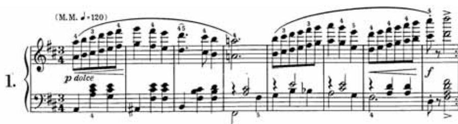
Ex. 138: Schumann, Papillons Op. 2, no. 1, bars 1–8

The waltz rhythms of several of the pieces obviously required rhythmic-pedalling, but in No. 1, I chose to sustain the pedal throughout each of bars 1–8, (see Ex. 138), ensuring that the melodic line was legato , but also aiding the sweeping four-bar phrases. Despite Schumann's stringent technical training at the time, it is possible to imagine that neither he nor Clara, felt obliged to finger the legato octaves, but that the pedal was used here instead; I found that this actually allowed greater freedom and dynamic control throughout the opening phrases.