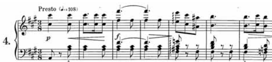
Ex 140: Schumann, Papillons Op. 2, no. 4, bars 1–7

In No. 4, the quaver rests in bars 1, 5 and 6 (see Ex. 140) influenced my decision to play with very little pedal. The notation suggests that Schumann required a light, buoyant touch, and I reserved the pedal for bars where the left hand had a crotchet on the first beat.