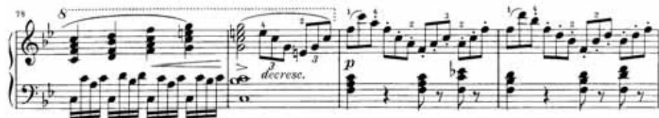
Ex. 114, Schubert, Sonata in B flat, D 960, 1st movement, bars 78–81

Similarly, bars 78–79 (see Ex. 114) were legato-peddalled, then bars 80–81 required no pedal at all.