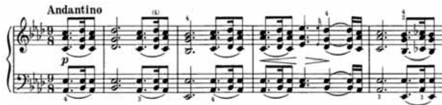
Ex. 96, Schubert, Moments musicaux no. 2, bars 1–4

I did consider playing the main theme of the second of the Moments musicaux without pedal (see Ex. 96) but decided that Schubert would probably have relied on the pedal here for warmth of tone, and for the realisation of slurs. Although the small gaps that would usually be present if rhythmic-peddalling was employed seemed appropriate, in performance, I found that I could not reconcile this idea with the actual sound produced. While perhaps not strictly legato pedalling, I finally settled on a more-or-less continuous sound with no gaps.