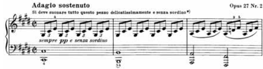
Ex. 69: Beethoven, Sonata in C sharp minor, Op. 27, no. 2, 1st movement, bars 1–3

When writing about the long pedalled passage in the opening theme of the slow movement of Beethoven's Piano Concerto no. 3 in C minor, Op. 37, Czerny noted that the raised dampers "worked very well on the weak-sounding pianos of that time, especially if the una corda pedal was used at the same time." He did advise that, on the newer pianos which had a stronger tone, the "damper pedal be reapplied with each significant change of harmony, yet so that no break in the tone be noticed." 77 A performance incorporating this legato-pedalling can be found on the Supplementary CD: track 2. Although the intention was to play the movement in exactly the same manner as the long-pedalled version, except for the changes of pedal, I instinctively took time on some changes of harmony, whereas the long-pedalled version tended to flow smoothly without interruption. Even if Beethoven did indeed change the pedal at times through this movement, (although I do not believe this to be the case), I do not believe that this would have resembled systematic legato-pedalling, but rather just the odd change here or there to alleviate the accumulation of sound.