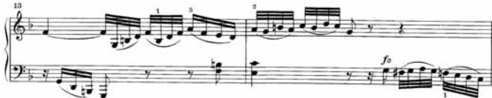
Ex. 56: Haydn, Sonata in C, Hob. XVI:50, 2nd movement, bars 13–14

As in the first movement, many of the florid passages (see Ex. 56) were enhanced by registral use of pedal; despite some non-harmony notes, the effect was always pleasant and acceptable in terms of clarity.