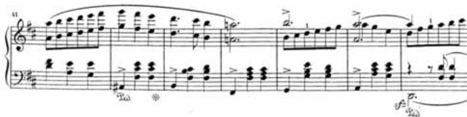
Ex. 149: Schumann, Papillons Op. 2, no. 12, bars 41–47

only two separate bars of pedalling when the left hand has a waltz accompaniment figure, as in bar 42 (see Ex. 149).