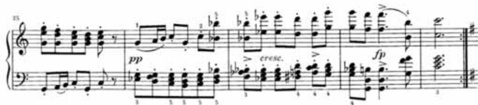
Ex. 94: Schubert, Moments musicaux no. 1, bars 25–29

An exception was made for some of the forte/piano chords, especially the rolled chord in bar 28 (see Ex. 94), where pedal was required to add volume and sustain the bass. This also had the advantage of connecting the slur in the right hand, which otherwise could not be adequately realised.