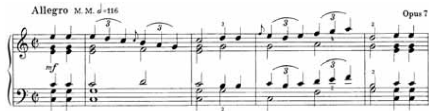
Ex. 76: Voříšek, Impromptu in C, Op. 7, no. 1, bars 1–4

figure that appears throughout the impromptu was usually pedalled along with the rest of the phrase, although it was often left un-pedalled as an upbeat to give the music a more characteristic, light-hearted lift. Similar upbeats in the answering phrases (see bar 5), however, soon became rather monotonous in their prominence so it seemed preferable not to draw too much attention to the frequent repetitions of this pattern by smoothing them over with a little touch of pedal.