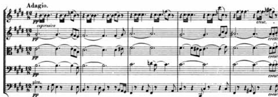
Ex. 116, Schubert, String Quintet in C, D 956, 2nd movement, bars 1–5

Considering the similarity of the scoring here to the Adagio movement of the String Quintet — written around the same time in 1828 (see Ex. 116) — I did wonder whether the left hand notes should resemble pizzicato , but it became clear that a more-or-less continuous use of pedal was required to sustain the melodic line.