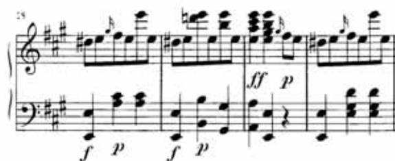
Ex. 39: Field, Sonata in A, Op. 1, no. 2, 2nd movement, bars 18–21

The second movement, due to its lively, more boisterous character, did not require as much use of pedal. In the first section I felt that dabs of pedal were effective on the many sudden forte , fortissimo or sforzando beats throughout the movement (see Ex. 39, bars 18–20).