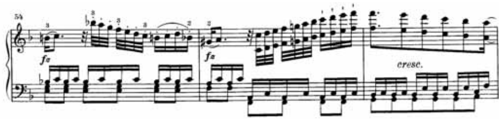
Ex. 58: Haydn, Sonata in C, Hob. XVI:50, 2nd movement, bars 54–56

It was interesting to note that the ascending octave scale in bar 55 (see Ex. 58) — a passage that is problematic on the modern piano — sounded light but not dry without pedal.