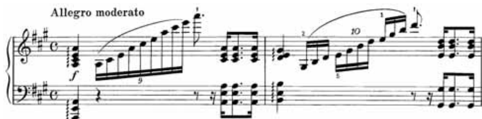
Ex. 33: Field, Sonata in A, Op. 1, no. 2, 1st movement, bars 1–2

John Field (1782–1837) wrote his three Op. 1 piano sonatas in 1801, when he was employed to demonstrate pianos for the Clementi manufacturing firm. It was therefore appropriate to perform his works on the Clementi piano. Although the structure of these sonatas reflects the influence of his teacher, Clementi, the style is already different, especially in the use of the pedal. The opening of the second sonata has several virtuosic flourishes, which I pedalled to achieve a sense of bravura by building a rush of sound over a range of five octaves (see Ex. 33).