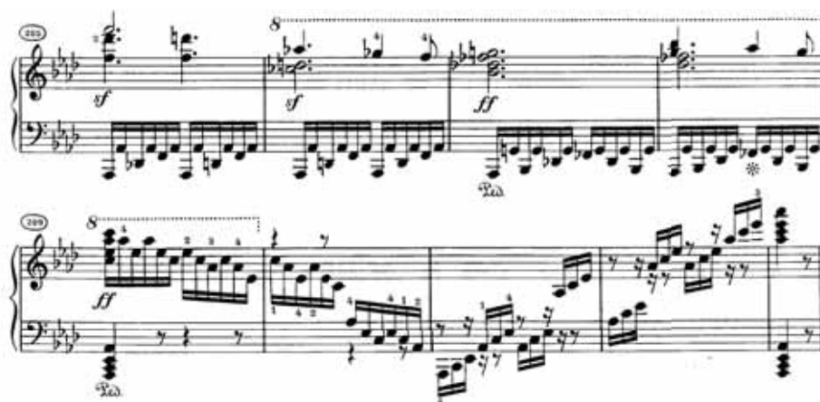
Ex. 110: Beethoven, Sonata in A flat, Op. 110, 3rd movement, bars 205–213