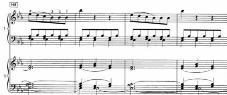
Ex. 17: Mozart, Piano Concerto in C minor, K 491, 1st movement, bars 148–151