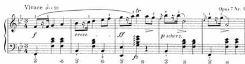
Ex. 136: Chopin, Mazurka, Op. 7, no. 1, bars 1–5

In the Mazurka Op. 7, no. 1 Chopin's staccato notation on the bass note indicates how the pianist should play, not how it should sound (see Ex 136). In this case, the bass notes are played quickly with a slight accent (the hand must move swiftly to the higher register of the chords), but the pedal is obviously intended to sustain this bass note; the rests in the right hand are similar to those in the mazurka Op. 6, no. 2. I found that Chopin's release signs were quite specific: the longer pedals in bars 1–2 contrasted well with shorter pedals in bars 4–5, which created a lighter, scherzando character.