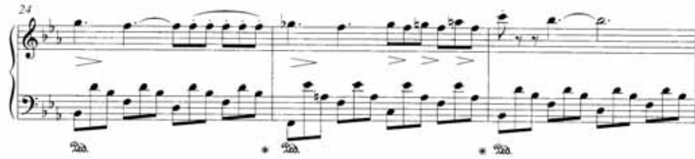
Ex. 118: Field, Nocturne no. 1 in E flat, bars 24–26

My first impression was that the pedalling should continue throughout the whole piece, despite some sections being notated without pedal, but in performance it was obvious that the section marked scherzando beginning in bar 15 (see Ex. 119), should be played without pedal. Due to the long resonance of the Clementi piano, these notes never sounded “clipped”, but the lighter, less sustained character actually added to the playful nature of the passage, a sort of refrain or ritornello passage linking the main ‘verses’ of this of the piece in strophic form.