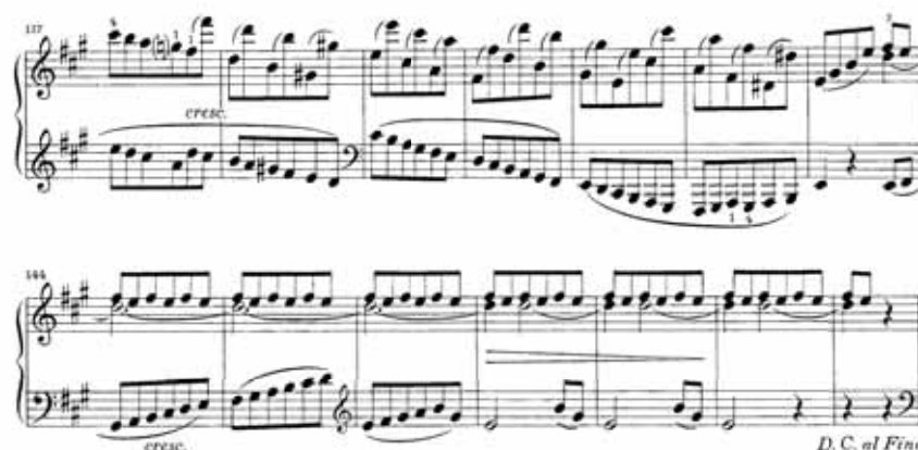
Ex. 85: Voříšek, Impromptu in A, Op. 7, no. 4, bars 137–150

Marked sempre piano e legatissimo , the soft dynamic is typical of this type of writing, (resembling also the broken two-handed passage in the Haydn Sonata in C Hob. XVI:50, see Ex. 52); the legatissimo marking, however, is curious as pedal is indicated throughout. Nannette Streicher once described the undamped sound played pianissimo as the sound of a glass harmonica, and when played fortissimo as the sound of an organ or the fullness of an entire orchestra. 90 This passage builds with a long sustained crescendo towards the end of the trio (see Ex. 85) as the left hand delivers a descending scale down to the lowest register and back up again; the use of pedal to create an atmospheric blurring through the long wave of sound here was found to be very effective.