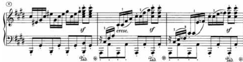
Ex. 71: Beethoven, Sonata in C sharp minor, Op. 27, no. 2, 3rd movement, bars 6–8

and I believe that Beethoven often used the pedal to achieve contrast. My intention here was also to highlight the difference between the slurred and unslurred semiquavers (see Ex. 71), something which would not be heard as clearly if these bars were pedalled. I used some pedal through the slurs in bars 7–8 simply to create excitement at this point by enhancing the notated crescendo , despite the continuation of staccato in the left hand.