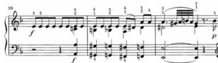
Ex. 8: Mozart, Fantasia in D minor, K 397, bars 20–22

The declamatory section at bar 20 (see Ex. 8) did seem to require the use of pedal and could be considered almost an improvisatory passage. As with some of the shorter passages in the C.P.E. Bach Fantasia, which are likewise broken up into sections divided by rests, bars 21–23 could well have been played with the use of a hand stop as it does seem to work remarkably well without pedal changes.