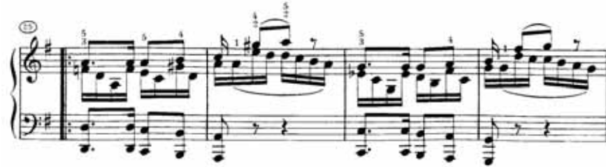
Ex. 14: Mozart, Sonata for Piano and Violin in G, K 379, 2nd movement, bars 25–28

is not in keeping with the style of this variation. In the performance, rhythmic-pedalling was employed on the first beats of bars 26 and 28 to slightly lengthen the bass quaver, thus allowing the hand to leave the note in time to reposition itself in the treble register. Touches of pedal were also used on the first beats of bars 25 and 27, given that the corresponding passage in the theme is marked forte , and a warm, full sound is suggested here by the texture.