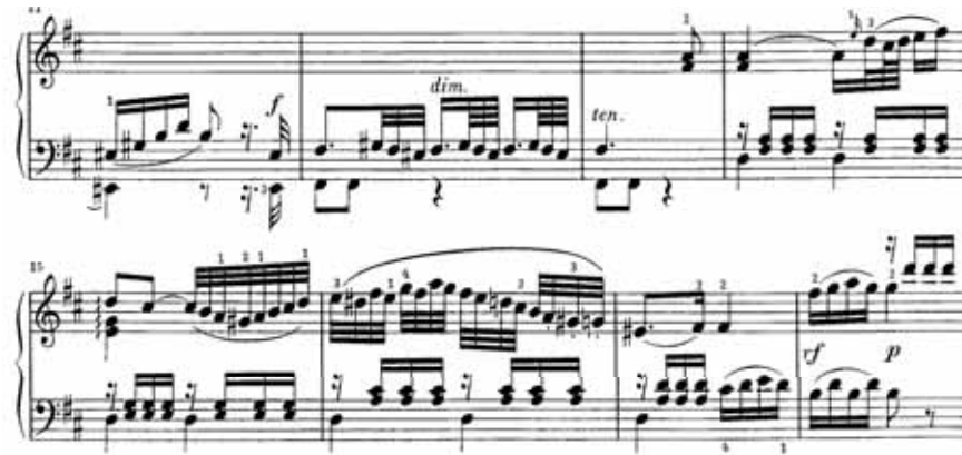
Ex. 22: Clementi, Sonata in F sharp minor, Op. 25, no. 5, 2nd movement, bars 11–18

Clementi requires a more legato approach, it was found that use of the pedal was not required due to the resonance of the Clementi piano.