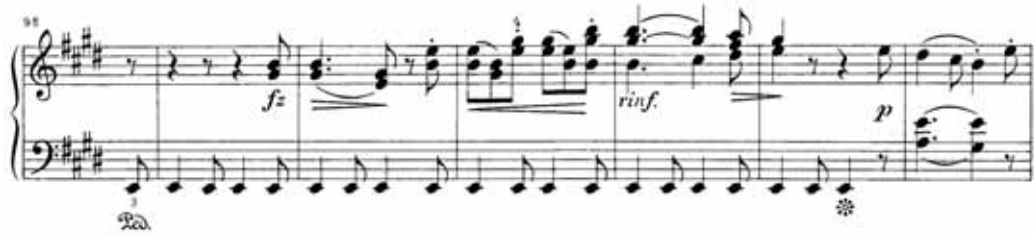
Ex. 88: Voříšek, Impromptu in E, Op. 7, no. 5, bars 98–103

The sixth impromptu seems to reflect Voříšek's professional work as an organist, because the opening (see Ex. 89) relies heavily on finger legato rather than on pedalling.