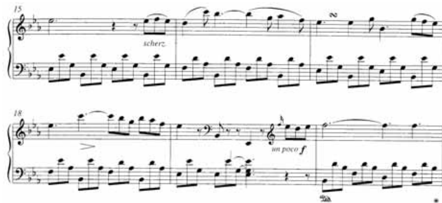
Ex. 119: Field, Nocturne no. 1 in E flat, bars 15–20

My first impression was that the pedalling should continue throughout the whole piece, despite some sections being notated without pedal, but in performance it was obvious that the section marked scherzando beginning in bar 15 (see Ex. 119), should be played without pedal. Due to the long resonance of the Clementi piano, these notes never sounded “clipped”, but the lighter, less sustained character actually added to the playful nature of the passage, a sort of refrain or ritornello passage linking the main ‘verses’ of this of the piece in strophic form.