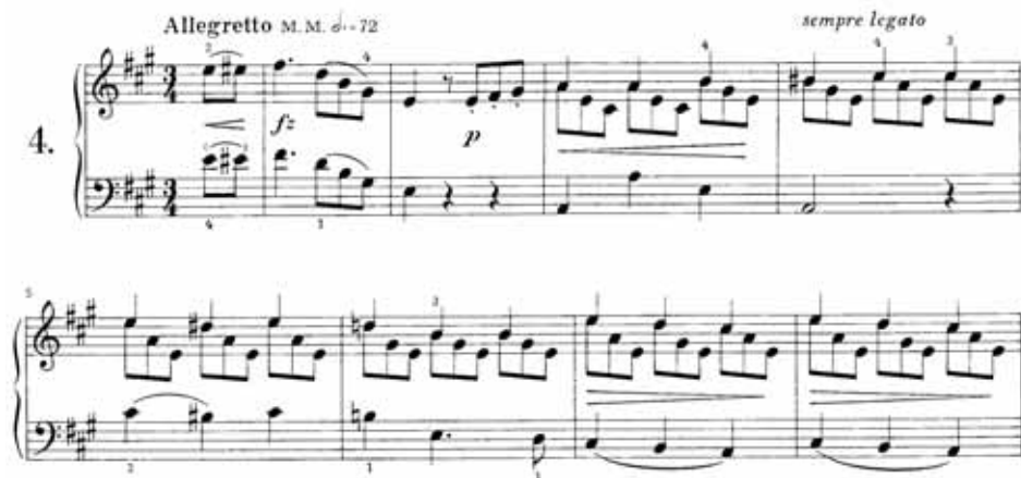
Ex. 82: Voříšek, Impromptu in A, Op. 7, no. 4, bars 1–8

The fourth impromptu is written in a reasonably articulate style (see Ex. 82), and shows the influence of Johann Nepomuk Hummel (1778–1837). Voříšek studied for a time with Hummel, and in 1816 took on all of his students, so it can be assumed that he had some affinity with Hummel’s conservative style. Hummel disliked the over-use of pedals; his admirers, when comparing his playing to that of Beethoven, described Beethoven’s playing as a “confused noise.” 88 As late as 1828, Hummel still considered the ‘normal’ touch to be detached, despite the gradual transition from a ‘normal’ touch of half the value of the note, as described by C.P.E. Bach, to three quarters of the value, as described by Türk.