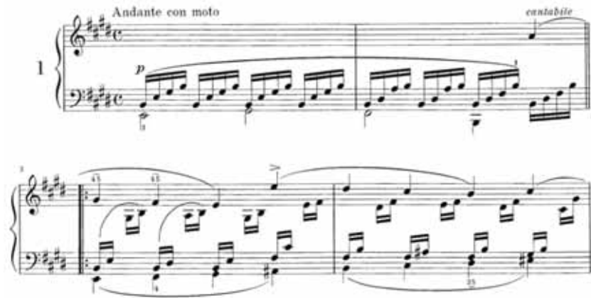
Ex. 129: Mendelssohn, Lieder ohne Worte, Op. 19, no. 1, bars 1–4

On closer inspection, however, the only two pedal indications suggest that Mendelssohn did not write this work with legato-pedalling in mind. The pedal indication in bar 24 (see Ex. 130) would otherwise be superfluous. I found in performance (as in the Liszt Etude Op. 1 no. 12) that the use of finger-legato throughout the melodic and bass-line slurs provided a satisfactory, flowing line; I pedalled here mainly for sonority, contrasting this with transparency of the softer passages.