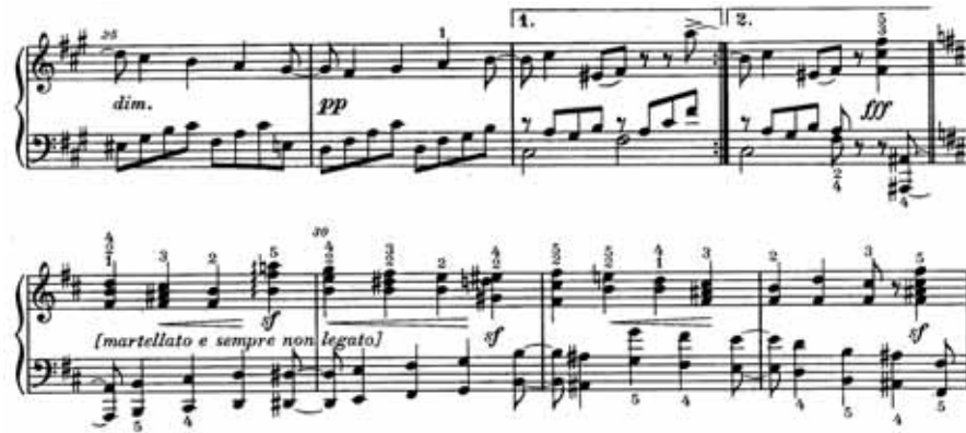
Ex. 48: Dussek, Sonata in F sharp minor, Op. 61, 2nd movement, bars 25–32

The quietly flowing episode in G flat major marked sempre dolce and molto legato (see Ex. 49) was pedalled throughout, and the una corda pedal was also employed in order to capture the ethereal nature of the passage. 52