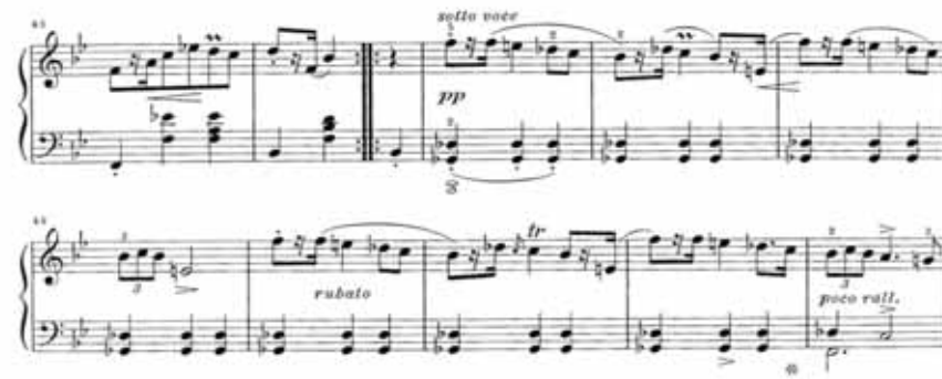
Ex. 137: Chopin, Mazurka, Op. 7, no. 1, bars 43–52

On reflection, I realize that in performance, I did not follow some of the pedalling indications as precisely as I had intended. Even allowing for the difficulty in ignoring modern pedalling techniques, I found that my use of pedal was always intrinsically linked to the moment — the touch, the sound, the acoustics, the tempo and every other aspect of performance. 121 Contemporary accounts of Chopin’s playing describe how the pedal was an integral part of his performance. Given the fact that he was known for subtly varying phrasing and rhythm on repetitions, and considering also that multiple versions of his works exist, it is probably safe to assume that he used the pedal in a similar, intuitive manner.