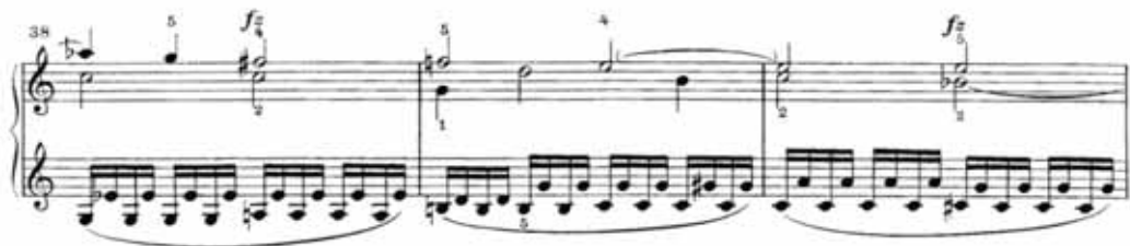
Ex. 54: Haydn, Sonata in C, Hob. XVI:50, 1st movement, bars 38–40

Some rhythmic-pedalling also enriched the tone colour of bars 38–40 (see Ex. 54), and helped to amplify several sforzandi .