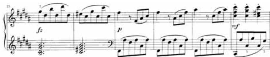
Ex. 90: Voříšek, Impromptu in B, Op. 7, no. 6, bars 25–30

The widespread broken chordal writing of the bass accompaniment through much of the sixth impromptu also required the use of pedal (see Ex. 90, bars 27–30); in this case I used rhythmic-pedalling, releasing the pedal on the third beat of each bar.