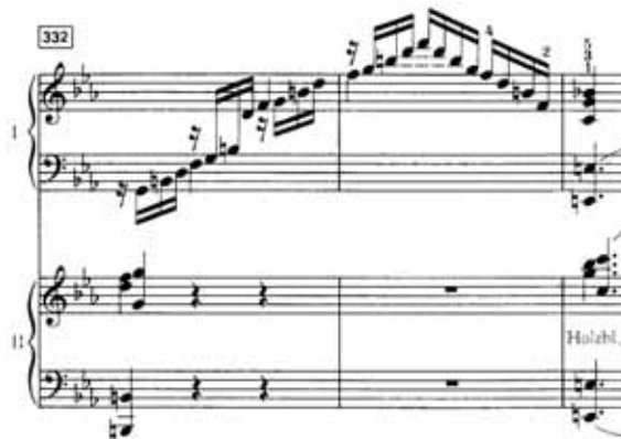
Ex. 19: Mozart, Piano Concerto in C minor, K 491, 1st movement, bars 332–333

The only passages that I felt really required the use of pedal were some of the arpeggiated sections where the piano was playing unaccompanied (see Ex. 19). This is similar to some of the arpeggiated passages already noted in the Fantasia as well as the Piano and Violin Sonata.