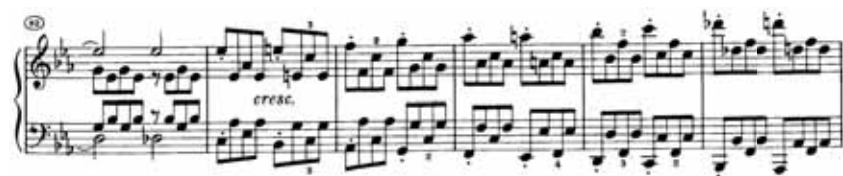
Ex. 101: Beethoven, Sonata in C minor, Op. 13, Pathétique , 1st movement, bars 92–97

Similar staccato notation is found in bar 7 of the Moonlight Sonata, 3rd movement (see Ex. 71, bars 7–8).