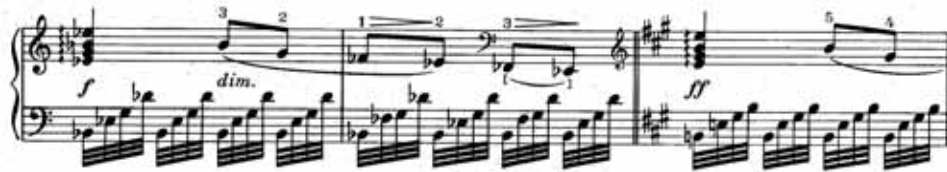
Ex. 43: Dussek, Sonata in F sharp minor, Op. 61, 1st movement, bars 32–34

Johann Baptist Cramer (1771–1858) stated that: “The Open Pedal is chiefly used in slow movements, when the same harmony is prolonged.” 48 This comment seemed directly relevant to the passage beginning at bar 32 (see Ex. 43), which was pedalled continuously through several bars of the same harmony. The wide span of the broken chord accompaniment necessitated the use of pedal, as the passage is primarily building in intensity through the rich sonority of the arpeggiation.