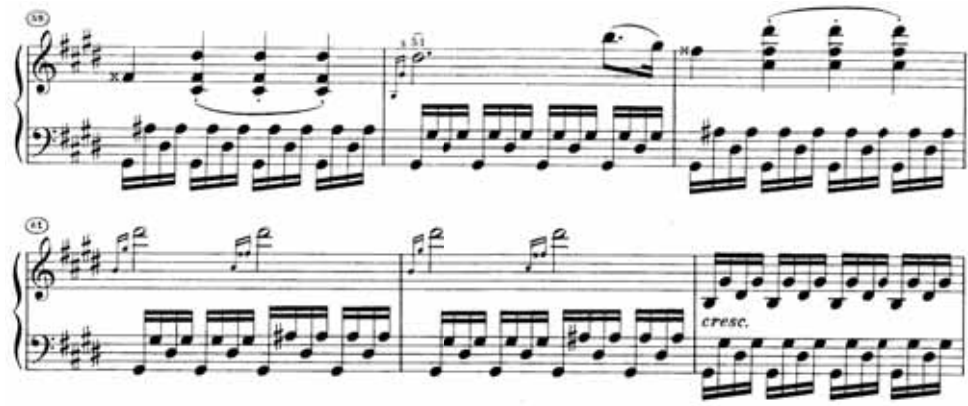
Ex. 72: Beethoven, Sonata in C sharp minor, Op. 27, no. 2, 3rd movement, bars 58–63

Another question that arose in preparation was whether to use the pedal in bars 163–164 (see Ex. 73); Beethoven has called for it only in bar 165–166. Breitman's opinion on 'negative indications' notwithstanding, 84 I found that in performance the use of pedal in bar 163–164 produced a more convincing result.