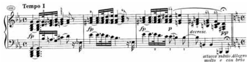
Ex. 65: Beethoven, Sonata in C minor, Op. 13, Pathétique , 1st movement, bars 133–136

There is one aspect, however, where the pedal was not used, i.e. for legato connection. In slurred chords, such as those found at bars 135–136 (see Ex. 65), it would not have been customary to use the pedal specifically for joining, although I did use a touch of pedal at the end of bar 136 as a registral sound. According to Czerny: "Beethoven understood remarkably well how to connect full chords to each other without the use of the pedal ." 72 Beethoven was known to have admired Cramer's studies — particularly the legato ones — and was very particular about finger-legato playing.