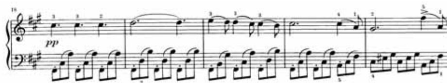
Ex. 97, Schubert, Moments musicaux no. 2, bars 18–22

Proof that Schubert was already using the pedal in this way can be found in the introduction of his Grazer Fantasie, D 605a, (see Ex. 98) where the use of pedal is more or less obligatory as it is written in Nocturne style. 93