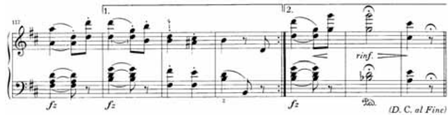
Ex. 81: Voříšek, Impromptu in D, Op. 7, no. 3, bars 117–120

movement to another. Unfortunately in performance, I did not continue the pedal through to the da capo repeat – although perhaps this was due to an instinctive feeling that it would sound rather out of place. (A similar pedal marking at the end of the trio in the fifth impromptu definitely seemed to require the rest and a moment of silence before continuing with the da capo repeat.)