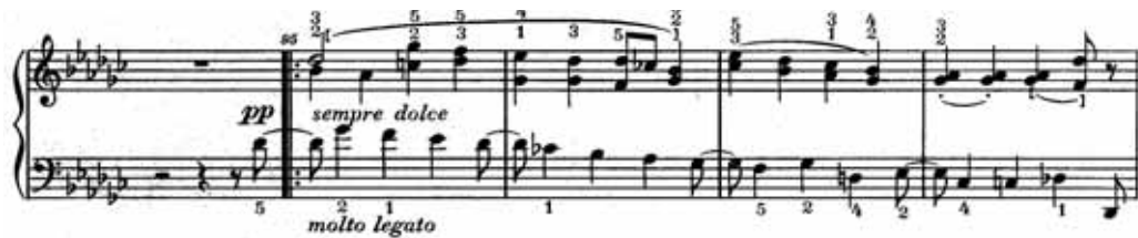
Ex. 49: Dussek, Sonata in F sharp minor, Op. 61, 2nd movement, bars 94–98

The quietly flowing episode in G flat major marked sempre dolce and molto legato (see Ex. 49) was pedalled throughout, and the una corda pedal was also employed in order to capture the ethereal nature of the passage. 52