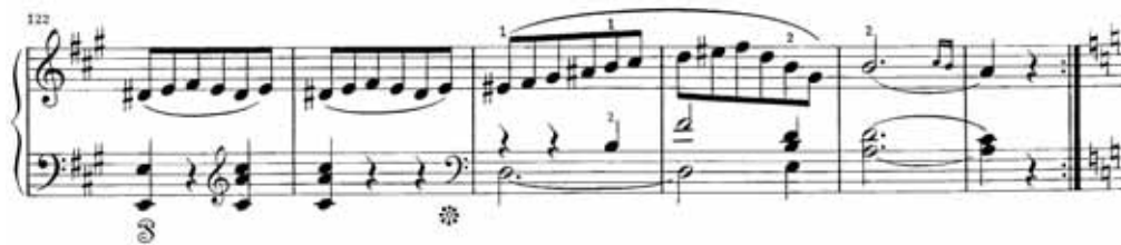
Ex. 41: Field, Sonata in A, Op. 1, no. 2, 2nd movement, bars 122–127

There was only one occasion in the whole sonata where I found that it was important to use the pedal even though it was not indicated. In bars 124–125 it was required to sustain the bass D through a stretch of a tenth (see Ex. 41) and although the right hand scale would seem to require a clean sound, the performance proved that the pedalled sound was not a problem in this regard. In other words, I chose not to take the F# in the right hand as would commonly be done today, assuming that to be more of a modern fingering that may have developed through the pianism of Liszt and Thalberg.