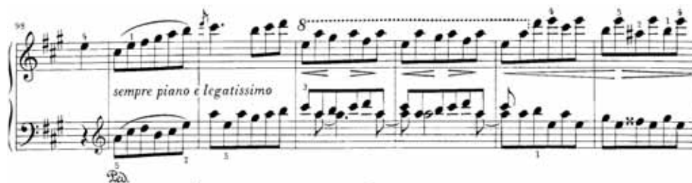
Ex. 84: Voříšek, Impromptu in A, Op. 7, no. 4, bars 98–103

The trio was written in a completely contrasting style resembling a carillon or perhaps even the pantalon (see Ex. 84), carrying on the tradition that already existed in England and France in the last decades of the eighteenth century. Despite its greater size and volume compared to the earlier pianos, the high register of the Graf piano is still very light, and this whole section was remarkably effective in performance when the pedal was depressed throughout the trio as indicated.