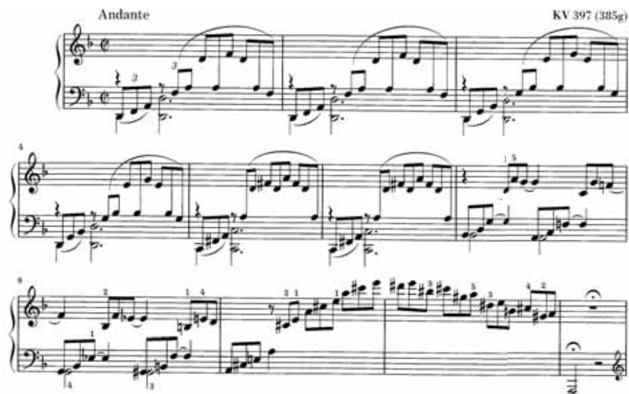
Ex. 4: Mozart, Fantasia in D minor, K 397, bars 1–11