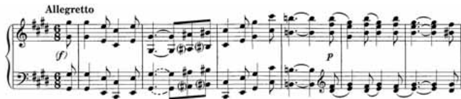
Ex. 31: Jadin, Sonata in C sharp minor, Op. 4, no. 3, 3rd movement, bars 1–6

It was interesting to discover that both of the quicker movements needed to be played at a slower tempo on the square piano, whereas the English instrument allowed brighter tempi that suited the movements equally well. In the performance of the third movement, I attempted in the main theme (see Ex. 31) to re-create the more orchestral sound of the French square piano by using short dabs of rhythmic-pedalling on the crotchets and dotted minims of bars 1–4 to add resonance.