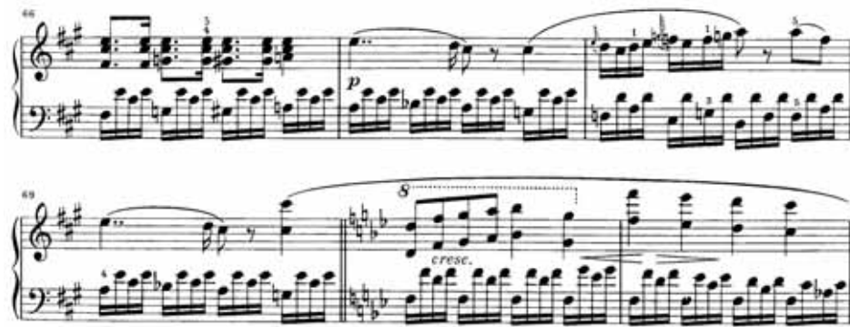
Ex. 113, Schubert, Sonata in B flat, D 960, 1st movement, bars 66–71

The sonata, however, does not quite fit Rosen's description of the piano writing of the Romantic generation of the 1830s, where "a fully pedalled sonority becomes the norm." 104 The unpedalled sonority was not yet an exception, or a special effect, and there are several sections in the first movement where I felt that a combination of rhythmic-peddalling and legato pedalling suited the phrasing. This combination of pedal techniques can be seen here in the following two examples. In bar 66 (see Ex. 113) rhythmic-peddalling was employed twice per bar. Bars 67–69 sufficed with one dab of pedal at the start of each bar, then from the upbeat to bar 70 a more legato approach was required.