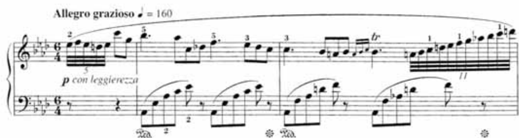
Ex. 125: Liszt, Etude, Op. 1, no. 9, bars 1–2

It can be seen in the Etude No. 9 that Liszt indicated pedal almost continuously (see Ex. 125).