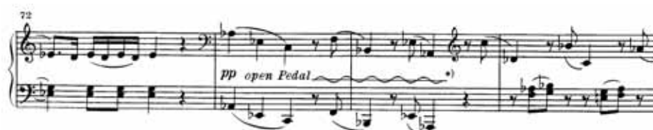
Ex. 51: Haydn, Sonata in C, Hob. XVI:50, 1st movement, bars 72–75

The two-note slurs in bars 2–3 override the weak-strong metre for a bar, the descending sevenths creating a moment of poignant expression. The thickly scored, arpeggiated chords in bar 6 also appear in the score as though they will sound short and clipped, but in actual fact, on the Clementi piano they sounded almost orchestral with their rounded, full tone negating the need for pedal. Haydn’s attempt to imitate the “Viennese” style becomes less apparent as the work progresses, however, and his writing adapts to the richer resonance of the English piano. One could even be forgiven for interpreting the opening bars as an example of the humour for which he is so well known. On every repetition of the theme in this monothematic sonata-form movement, the texture is less ‘dry’ until, at the climax of the development (the first indication of open Pedal ), 60 the theme is presented in a mystical way, in A flat major with pianissimo dynamics (see Ex. 51).