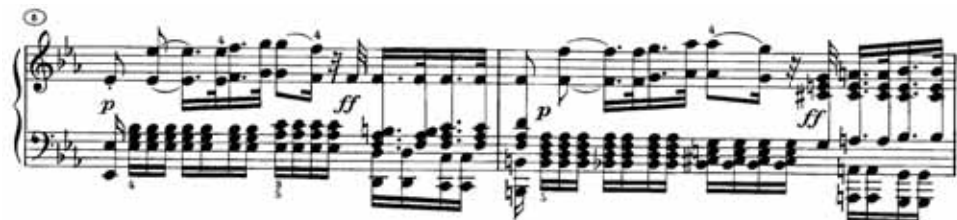
Ex. 61: Beethoven, Sonata in C minor, Op. 13, Pathétique , 1st movement, bars 5–6

The effect of a left hand accompaniment similar to bar 5 (see Ex. 61), in which the pedal is required to sustain a bass note while other notes of a chord are arpeggiated or filled out above, was becoming very important from the mid 1790s. Steibelt, Kalkbrenner and Dussek used similar notation with and without pedal indications, and a similar notation had already appeared in the Jadin Sonata in C sharp minor, Op. 4, no. 3 of 1797 (see Ex. 27). Use of the pedal was required here primarily to sustain the bass notes, but it had the added benefit of contributing to the fullness of sound, and creating a legato melodic line.