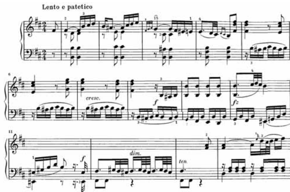
Ex. 21: Clementi, Sonata in F sharp minor, Op. 25, no. 5, 2nd movement, bars 1–14

style where the dampers could be raised for the entire movement as was sometimes customary with the French composers of the time. 30 Considering that Clementi was more conservative than his contemporaries, and that this sonata was written at the latest in 1790, (the latter years of the 1790s was a crucial period in the development of pedalling), I decided that I would first use the pedal as a special effect at the slurred diminished seventh chord bars 10–11. Here I found that the singing power of the instrument, best described in Clementi’s own words as “thick and sweet” as opposed to the “clear, sharp or silver” tone of Viennese pianos, 31 was sufficient when coupled with the normal legato touch and the after-ring of the bass register. The use of pedal was therefore not required.