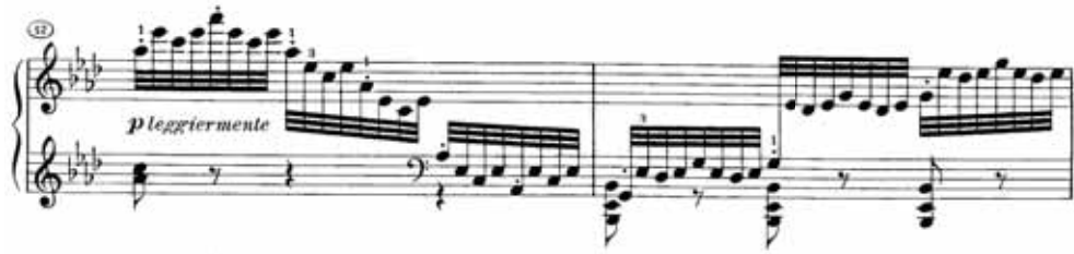
Ex. 100: Beethoven, Sonata in A flat, Op. 110, 1st movement, bars 12–13

The question still remained as to whether such a passage would be pedalled, as it is all one harmony throughout each bar. I finally decided that sparing use of the pedal allowed the passagework to remain light, yet the thumb and fifth finger staccato notes would sound articulate. 96