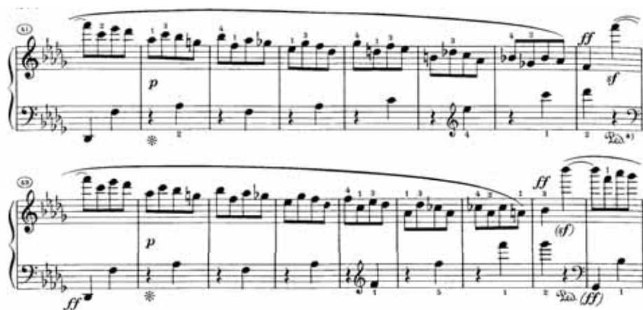
Ex. 104: Beethoven, Sonata in A flat, Op. 110, 2nd movement, bars 41–57

In the trio of the second movement (see Ex. 104), Czerny’s instruction “to be filled out harmonically with the pedal” is curious, as the use of pedal beyond the two fortissimo bars, would only amplify the effect of a naturally occurring crescendo as the long phrase descends through to the more penetrating middle register of the piano (certainly on the Graf). I chose to follow Beethoven’s pedal indications, and pedalled only the loud outbursts (for example bars 48–49); this had the effect of somewhat increasing the volume of the high register with its small tone, as well as sustaining the bass D flat, allowing it to sound concurrently with the F.