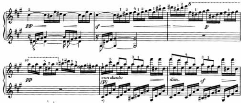
Ex. 45: Dussek, Sonata in F sharp minor, op. 61, 1st movement, bars 92–97

The atmospheric passage at bar 92–95 (see Ex. 45) worked effectively with a continuous use of pedal, as did the broken right hand melody from bar 96, where the wide span of a tenth on the fourth beat (left hand) could not be sustained with finger legato alone. Although this passage appears to require legato-pedalling (as would be the case on a modern instrument), it was apparent when playing the Clementi piano that rhythmic-pedalling twice per bar was sufficient.