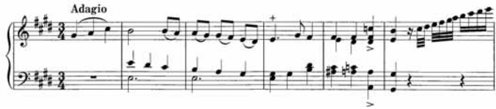
Ex. 30: Jadin, Sonata in C sharp minor, Op. 4, no. 3, 2nd movement, bars 1–6

My performance of the second movement relied less on the use of pedal, and more on an expressive delivery of the many appoggiaturas , together with some added ornamentation, to create emotional tension and release, and to heighten the dramatic narrative.