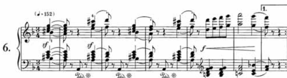
Ex. 141: Schumann, Papillons Op. 2, no. 6, bars 1–6

The extremely short pedal markings in No. 6 are curious (see Ex. 141); I understood them to indicate that the bass notes should be elongated by the pedal, although not in the sense of doubling the bass of the following chord. I believe that it is the first pedal indication of this type, where the pedal is used purely to prolong a note that must be released early due to the sudden shift in hand position. This also had the effect of animating the melodic contour of the bass line.