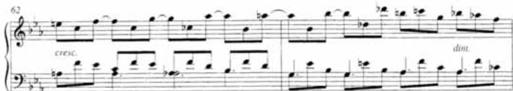
Ex. 121: Field, Nocturne no. 1 in E flat, bars 62–63

Field was obviously aware of passages that would not tolerate a pedalled sound due to conjunct movement and chromatic notes (see Ex. 121). In bars 62–63 his notation clearly indicates ‘finger-pedalling’, whereby the bass notes are sustained to alleviate the need for pedal as the harmonic rhythm and use of chromaticism increase. On the Clementi piano, there was little or no audible difference between passages played with and without pedal when ‘finger-pedalling’ was employed.