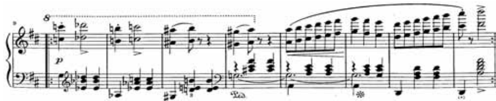
Ex. 139: Schumann, Papillons Op. 2, no. 1, bars 9–16

In bars 9–10 (see Ex. 139), however, I played the first beats without pedal in order to establish a contrast between the right hand staccato and the texture of bars 12–14, where Schumann indicates something other than ‘normal’ pedalling in order to connect the two halves of the phrase.