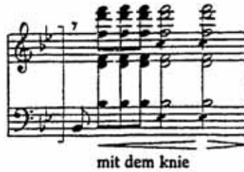
Ex. 62: Beethoven, sketch from “Kafka” Sketchbook

There are many passages in Beethoven’s earlier sonatas where the notation suggests that he was relying on the pedal; 70 this is confirmed by Czerny in his On the Proper Performance of All Beethoven’s Works for the Piano . 71 (Czerny heard Beethoven play these earlier sonatas and is therefore the best authority available to us today.)