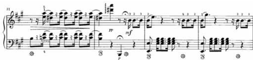
Ex. 37: Field, Sonata in A, Op. 1, no. 2, 1st movement, bars 31–34

Field's pedal indication encompassing a chord spread over the entire range of the piano proved to be extremely effective on the Clementi piano (see Ex. 37, bar 32).