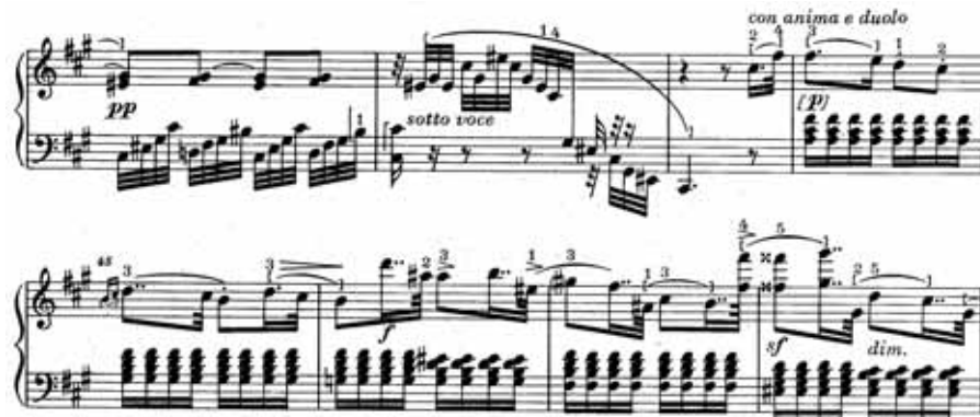
Ex. 44: Dussek, Sonata in F sharp minor, Op. 61, 1st movement, bars 41–48

The use of pedal was continued through to the end of this passage at bar 43 (see Ex. 44); despite the rests, the widespread dominant chord in bar 42 was obviously intended to be heard as one chord.