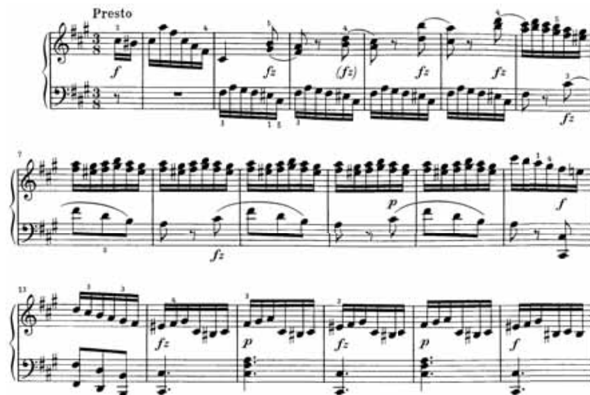
Ex. 24: Clementi, Sonata in F sharp minor, Op. 25, no. 5, 3rd movement, bars 1–18

The movement is written in a virtuoso style, (see Ex. 24) which returns to Clementi's earlier style of harpsichord writing. 33 The continuous semiquaver passage-work, including parallel thirds, is reminiscent of Scarlatti, 34 and influenced my decision not to use pedal for the greater part of this movement.