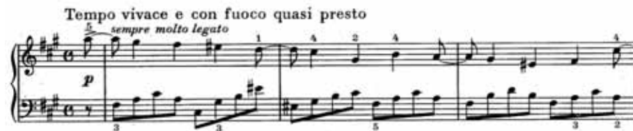
Ex. 47: Dussek, Sonata in F sharp minor, Op. 61, 2nd movement, bars 1–3

The second movement of the sonata (see Ex. 47) is a typical example of English piano writing where, despite the obvious cantabile nature of the long melodic line, there are very few slurs. It required continuous use of the pedal to enhance the singing quality of the melodic line and to enrich the sonority of the arpeggiated accompaniment.