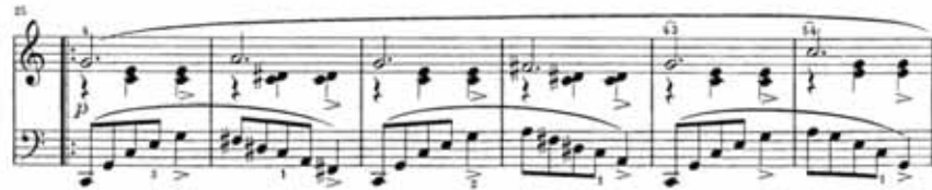
Ex. 143: Schumann, Papillons Op. 2, no. 10, bars 25–30

I used rhythmic-pedalling (once per bar) in the main thematic material of No. 10 (see Ex 143) despite the two-bar slurs, releasing the pedal towards the end of the bar to enable the accent on the third beats to be clearly audible.