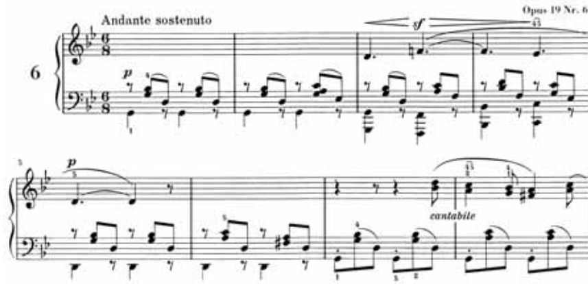
Ex. 133: Mendelssohn, Lieder ohne Worte , Op. 19, no. 6, Venetianisches Gondellied , bars 1–8

The instrument is not pushed to extremes, yet the writing requires a good technique and great tonal control, and I found that much of the piece could be played with finger-legato, relying on the natural resonance of the instrument. Contrasts of pedalled and non-pedalled sounds were considered normal at the time and are quite audible in the performance of this piece. As bars 1–6 are notated with many rests, and no pedal indications, I chose not to use the pedal until bar 7, where the accompaniment texture changes. I interpreted the left hand staccato markings on the bass notes from bar 7 (already seen in the second of the Schubert Moments musicaux , Ex. 97) as describing the movement of the hand, rather than a dry, staccato sound, and I therefore chose to use the pedal from this point onwards.