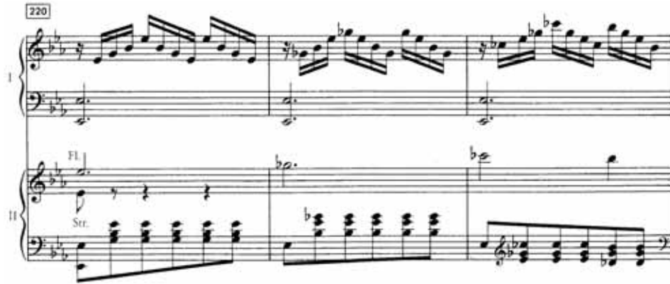
Ex. 18: Mozart, Piano Concerto in C minor, K 491, 1st movement, bars 220–222

The only passages that I felt really required the use of pedal were some of the arpeggiated sections where the piano was playing unaccompanied (see Ex. 19). This is similar to some of the arpeggiated passages already noted in the Fantasia as well as the Piano and Violin Sonata.