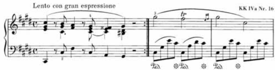
Ex. 124: Chopin, Nocturne in C sharp minor, Op. posth, bars 1–3

are many such chordal passages amongst Chopin's works, and invariably they can be satisfactorily played without the use of the pedal.