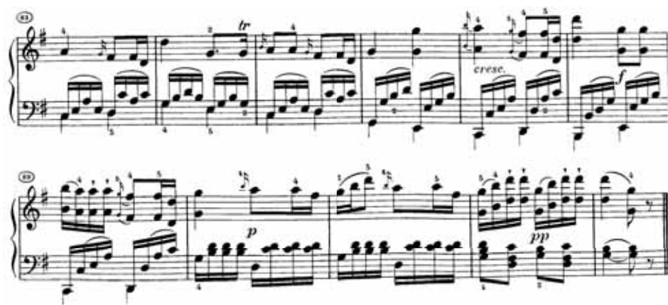
Ex. 9: Mozart, Piano Sonata in D, K 311, 2nd movement, bars 83–93