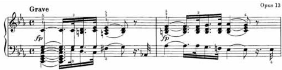
Ex. 60: Beethoven, Sonata in C minor, Op. 13, Pathétique , 1st movement, bars 1–2

time, I used no pedal in the first four bars. I slightly separated all the dotted chords despite the slurs in Czerny's own edition (c.1856–68). 68