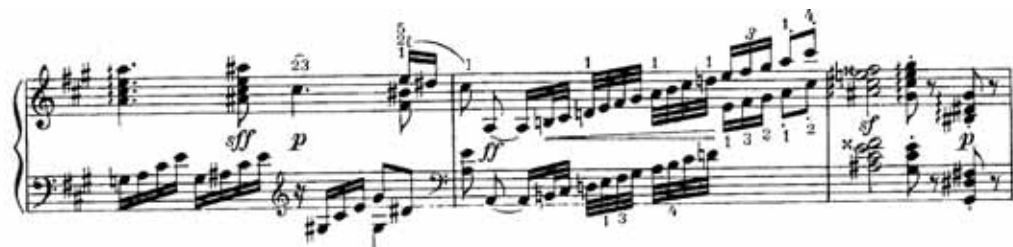
Ex. 46: Dussek, Sonata in F sharp minor, Op. 61, 1st movement, bars 106–108