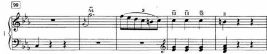
Ex. 16: Mozart, Piano Concerto in C minor, K 491, 1st movement, bars 99–103

Eva Badura Skoda states that the pedal “enriches the singing quality of any piano, new and old, due to sympathetic vibrations.” 27 The added ambiance of sympathetic vibrations was not relevant in much of the passage-work throughout the concerto, as the orchestra provided the fullness of sound. In the following passage the melodic line of the piano, with its silvery tone, cut through the sustained chords of the strings while the left hand quavers provided the rhythmic pulse (see Ex. 17).