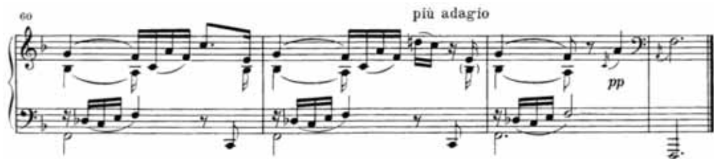
Ex. 59: Haydn, Sonata in C, Hob. XVI:50, 2nd movement, bars 60–63

The final 4 beats of the movement (see Ex. 59, bars 62–63) were played with one long pedal to collect and sustain the notes of the F major chord spread over several registers; this technique was later notated in the Field Sonata Op. 1, no 2, (see Ex. 37, bar 32).