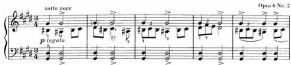
Ex. 135: Chopin, Mazurka, Op. 6, no. 2, bars 1–5

In the Mazurka Op. 7, no. 1 Chopin's staccato notation on the bass note indicates how the pianist should play, not how it should sound (see Ex 136). In this case, the bass notes are played quickly with a slight accent (the hand must move swiftly to the higher register of the chords), but the pedal is obviously intended to sustain this bass note; the rests in the right hand are similar to those in the mazurka Op. 6, no. 2. I found that Chopin's release signs were quite specific: the longer pedals in bars 1–2 contrasted well with shorter pedals in bars 4–5, which created a lighter, scherzando character.