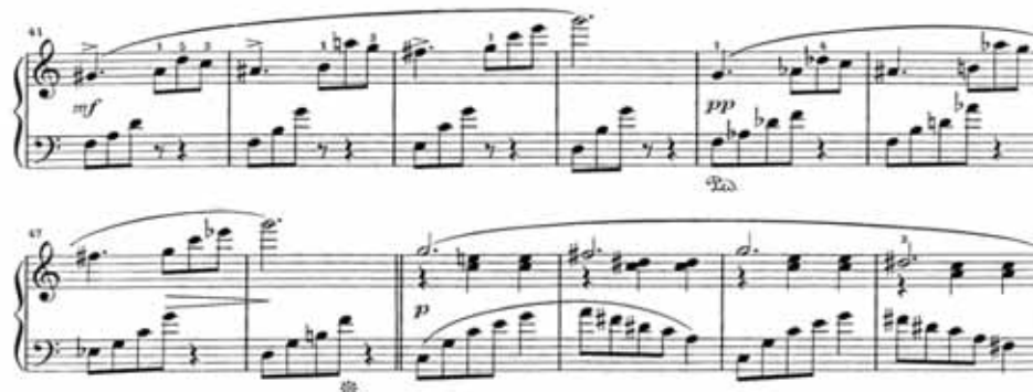
Ex. 145: Schumann, Papillons Op. 2, no. 10, bars 41–52

following Schumann's long pedal through bars 45–48; the latter was combined with the una corda pedal to create a more ethereal tone colour.