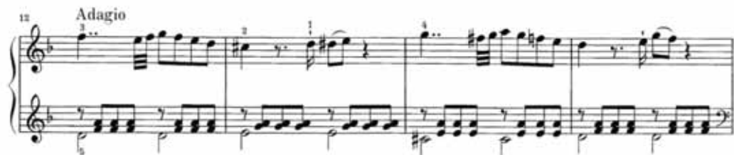
Ex. 7: Mozart, Fantasia in D minor, K 397, bars 12–15

Most of the Adagio section is written in a rhetorical style that virtually precludes the use of pedal. In his comprehensive treatise, Klavierschule (1789), Türk explains that “Heavy and light execution contribute a great deal to the expression of the prevailing character . . . . It is chiefly a matter of the proper application of detached, sustained, slurred, and tied notes”. 20 These were the criteria that guided my interpretation of passages such as the Adagio (see Ex. 7): the alla breve time metre, the strong and weaker beats within a bar, the length of detached notes, (i.e. the quavers in bars 12 and 14) and especially the two-note slurs. These slurred appoggiaturas, with their slight emphasis on the first note, and a lighter, shorter release note, as described by all the main tutors of the time, helped to create an expressive realisation of the prevailing character of the music.