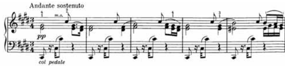
Ex. 115, Schubert, Sonata in B flat, D 960, 2nd movement, bars 1–5

Considering the similarity of the scoring here to the Adagio movement of the String Quintet — written around the same time in 1828 (see Ex. 116) — I did wonder whether the left hand notes should resemble pizzicato , but it became clear that a more-or-less continuous use of pedal was required to sustain the melodic line.