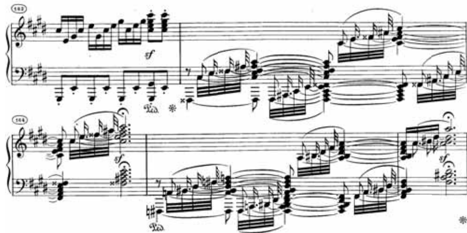
Ex. 73: Beethoven, Sonata in C sharp minor, Op. 27, no. 2, 3rd movement, bars 162–166

Another question that arose in preparation was whether to use the pedal in bars 163–164 (see Ex. 73); Beethoven has called for it only in bar 165–166. Breitman's opinion on 'negative indications' notwithstanding, 84 I found that in performance the use of pedal in bar 163–164 produced a more convincing result.