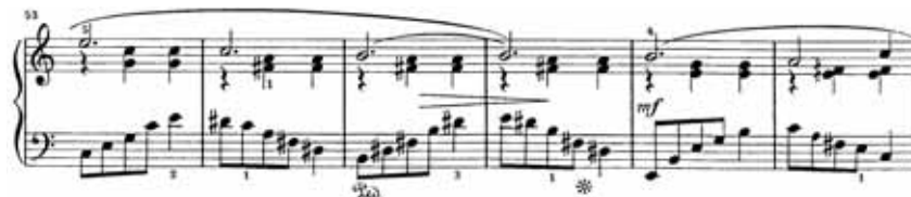
Ex. 144: Schumann, Papillons Op. 2, no. 10, bars 53–58

I alternated this with two-bar pedals when the harmonies were compatible because Schumann indicated something similar in bars 55–56 (see Ex. 144).