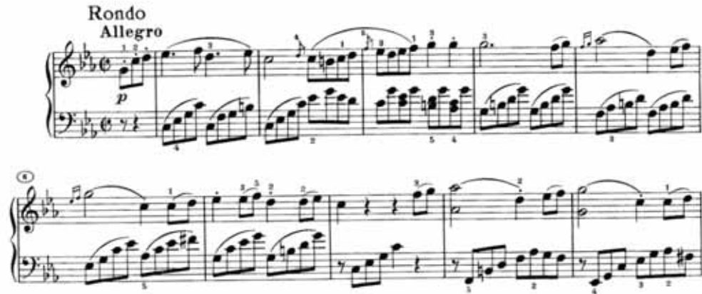
Ex. 68: Beethoven, Sonata in C minor, Op. 13, Pathétique , 3rd movement, bars 1–10