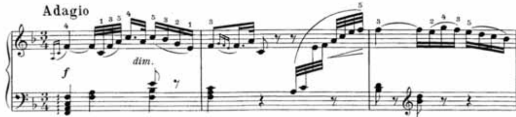
Ex. 55: Haydn, Sonata in C, Hob. XVI:50, 2nd movement, bars 1–3

Here I used pedal on the opening chords (see Ex. 55, bar 1) even though the bass chords were already rich in overtones. I decided that, despite the abundance of slurs, this movement was not written in the Viennese rhetorical style, but rather that Haydn had adopted the English style with its longer phrases, cantabile tone and legato touch.