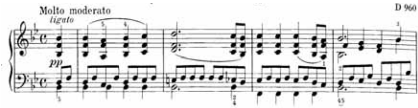
Ex. 111, Schubert, Sonata in B flat, D 960, 1st movement, bars 1–4

recommendation in his Anweisung zum pianoforte-Spiele (1828) that the pedal be used in “slow rather than in quick movements, and only where the harmony changes at distant intervals.” 101