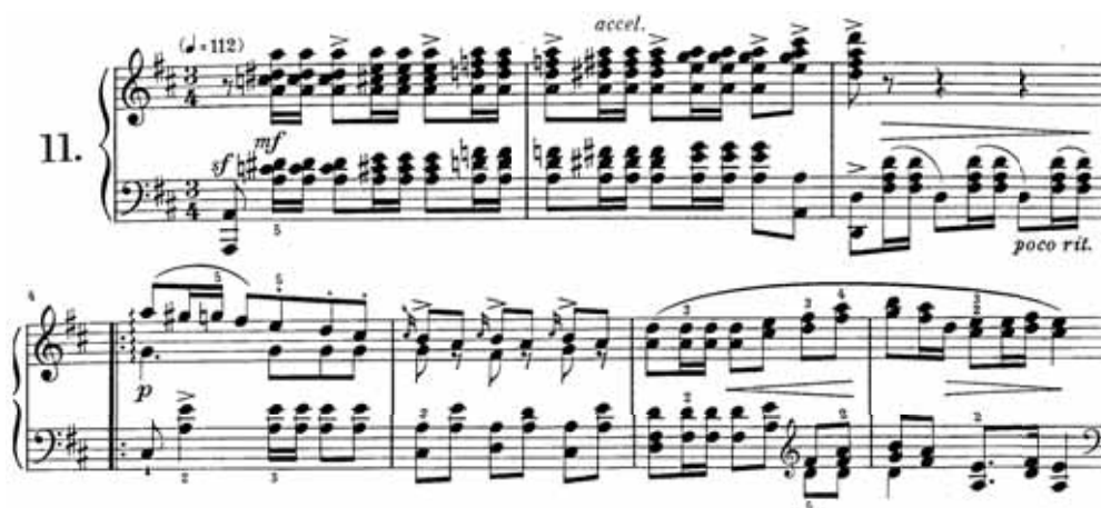
Ex. 146: Schumann, Papillons Op. 2, no. 11, bars 1–7

No. 11, with its many changes of character and texture, required a variety of pedal techniques, most of which have already been mentioned above. The introductory bars required the use of pedal to enhance the sonority, and I found that one long pedal through bars 1–2 (see Ex. 146) created a vibrant tone without causing blurring. A similar technique was used through bar 6 and the first half of bar 7. The long pedal is barely audible in the recording, but the performance shows that the quick legato-pedal changes required on a modern grand piano were not always necessary on the earlier instruments.