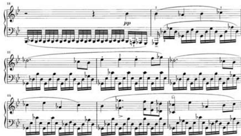
Ex. 112, Schubert, Sonata in B flat, D 960, 1st movement, bars 19–26

When preparing the Schubert works, I was able to play on a c.1825 Viennese giraffe piano, 102 but although well suited to the Voříšek Impromptus and even the Schubert Moments musicaux , this instrument did not have the subtlety of touch and pedalling that the Graf provided. The final three sonatas were written at a time when Schubert had at his disposal his brother’s Elwerkember piano, 103 similar to the Graf used in this performance. The subtleties of pedalling required in the Sonata in B flat reflect the fact that Schubert was able to exploit the greater sophistication of the instrument that he was using when the work was conceived.