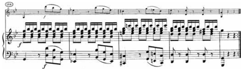
Ex. 12: Mozart, Sonata for Piano and Violin in G, K 379, 1st movement, bars 188–192

The orchestral-like writing in the coda of the Allegro (see Ex. 12), also invites the use of pedal to enhance the richness of sound and especially to enable the bass slurs. The tremolo was played in an articulate manner on the Stein piano (not close to the key-bed as would be possible on a modern piano), in order to provide the necessary rhythmic impetus. Due to the instrument's limited resonance, I was able to pedal through each entire bar, including the rests, without losing the essential rhetorical character.