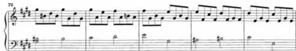
Ex. 29: Jadin, Sonata in C sharp minor, Op. 4, no. 3, 1st movement, bars 72–76

that enhanced the “expressive and textural effects in his piano music”. 40 Adam also wrote in his treatise that pianists were beginning to develop more refined pedalling techniques in the 1790s. 41 With this in mind, I used the pedal to colour some of the modulating passage-work in the development, and to add warmth to the harmony (see Ex. 29). This passage is similar to several passages in the first movement of the Haydn Sonata in C, Hob. XVI:50 (see Ex. 54). I used rhythmic-pedalling, once per bar throughout this section. There is no proof that pianists pedalled this way, but given the influence of the English piano school, as well as the use of pedal by Steibelt in his drum-bass and tremolando accompaniments, it is easy to imagine that the pedal may have been used to colour interesting harmonic progressions, and with further experimentation, I might well have decided on even longer blocks of pedal.