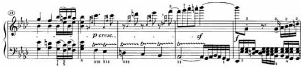
Ex. 102: Beethoven, Sonata in A flat, Op. 110, first movement, bars 24–28

The extended right hand rolled chords in bars 25–27 (see Ex. 102) are similar to those in the Moonlight Sonata (see Ex. 72, bar 59) and also seem reliant on the use of pedal to bind the chords together as a whole.