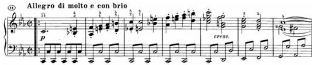
Ex. 63: Beethoven, Sonata in C minor, Op. 13, Pathétique , 1st movement, bars 11–17

Following Czerny's instructions for the final eight bars of the exposition, I used the pedal to create a full, sonorous tone (see Ex. 64, bars 126–132).