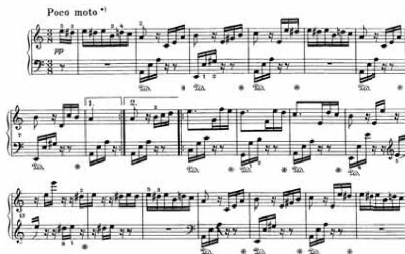
Ex. 75: Beethoven, Für Elise , WoO 59, 1–19

Overall the pedalling in Für Elise is not as forward-looking as may first appear. There are several instances of registral pedalling, for example in bars 12–13 (see Ex. 75), and the pedalling throughout the main theme can also be seen as a type of thematic pedalling (see reference to this at Ex. 79).