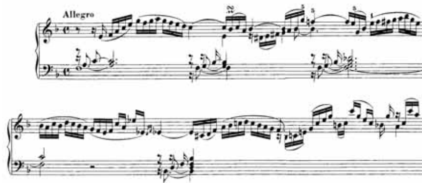
Ex. 1: C.P.E. Bach, Fantasia in F, first two lines of bar 1

necessary precautions in the face of its reverberations, the most delightful for improvisation.” 11 I found that it was certainly possible to play the entire passage with the undamped register. Although it seemed first as though a whole range of different harmonies would be blurred together, and that the articulation would be hidden by the pedalled sound, in fact when the “the necessary precautions were observed”, it was surprisingly successful. The ‘precautions’ in this case were to play slightly slower than a typical Allegro and to take just a little more time in a few places, giving the harmonies time to disperse.