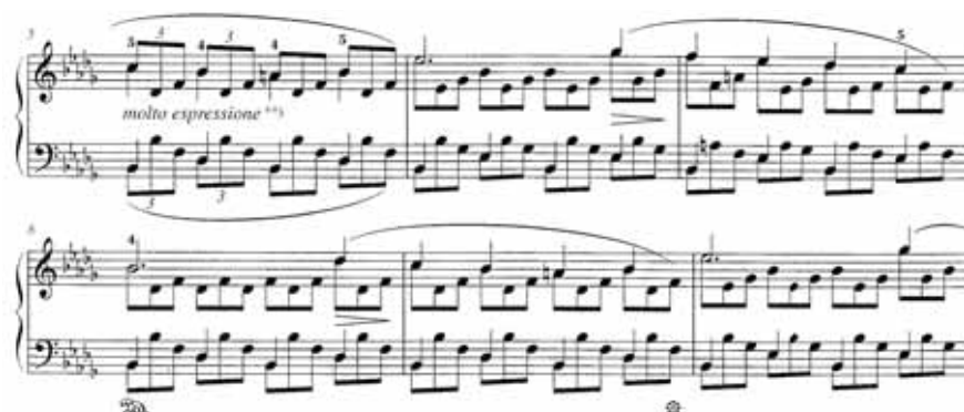
Ex. 128: Liszt: Etude, Op. 1, no. 12, bars 5–10

In No. 12 (see Ex. 128), there are extremely few pedal indications, and those that are present hardly indicate anything unusual. Even though the melodic phrases again extend over several bars it does not appear as though Liszt was intending it to be pedalled throughout in a legato manner. Although the pedal was employed in this étude to create a full sound, it was not relied upon for sustaining the crotchets, or for the legato melodic line. (Considering Liszt's training with Czerny, he would have been well capable of connecting these notes with the fingers.) Use of the pedal was also necessary in some bars to sustain the bass notes when the left hand accompaniment spanned a wider range.