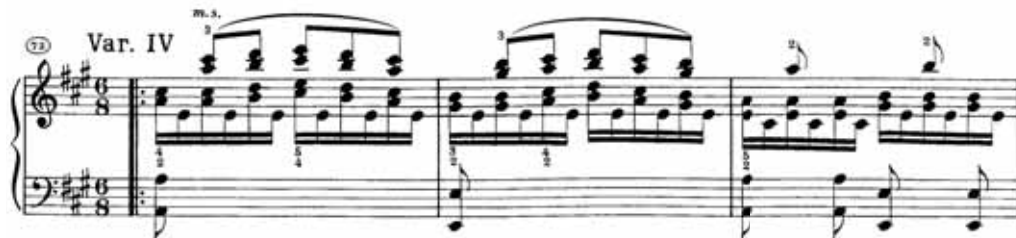
Ex. 15: Mozart, Sonata in A, K 331, 1st movement, bars 73–75

This is based on an earlier, similar example found in the first movement of the Piano Sonata K 331 (1778). Without pedal on the bass octaves (see Ex. 15), these notes sound clipped and not in keeping with the smooth nature of this variation, as the left hand requires time to move up to the treble notes on the second quaver beat.