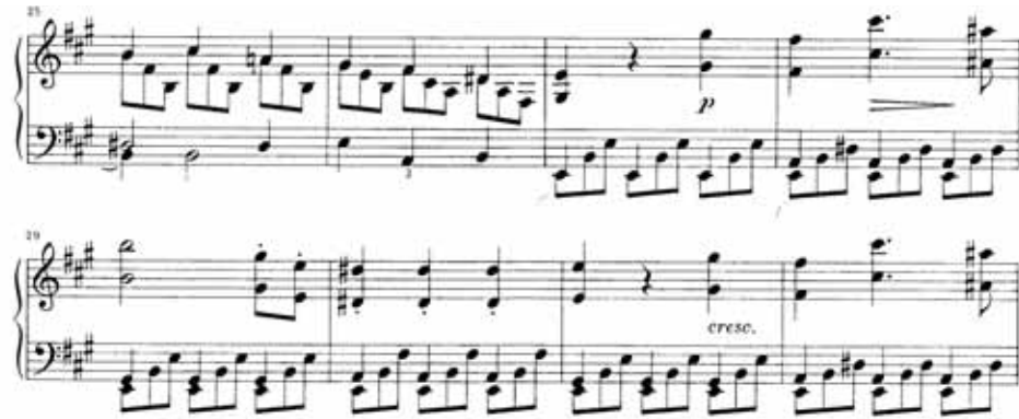
Ex. 83: Voříšek, Impromptu in A, Op. 7, no. 4, bars 25–32

Further on in the fourth impromptu, there was scope for an even greater variety of pedalling: bars that contained left hand polyphony were provided with longer pedals (see Ex. 83, bar 25), yet bar 26 was played with no pedal so that the bass-line could be articulated with a non-legato touch. The long melodic line written in octaves commencing in bar 27 was played with almost continuous pedalling except for the bars containing staccato markings. This is in keeping with the instruction given by Hummel in his Ausführliche theoretisch-practische Anweisung that “melodic passages should not be played detached like other passages; their delivery must be connected, and the melody brought out.” 89