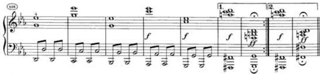
Ex. 64: Beethoven, Sonata in C minor, Op. 13, Pathétique , 1st movement, bars 126–132

Following Czerny's instructions for the final eight bars of the exposition, I used the pedal to create a full, sonorous tone (see Ex. 64, bars 126–132).