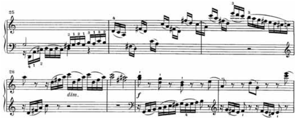
Ex. 53: Haydn, Sonata in C, Hob. XVI:50, 1st movement, bars 25–31

Some rhythmic-pedalling also enriched the tone colour of bars 38–40 (see Ex. 54), and helped to amplify several sforzandi .