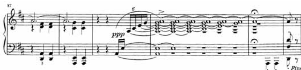
Ex. 150: Schumann, Papillons Op. 2, no. 12, bars 87–92

The long pedal-point that extends from the bass D in bar 47 through to bar 73 is notated by Schumann with one long pedal, and this was effective in performance on the Graf. The final chord on the dominant, which has the effect of ‘disappearing’, is almost the reverse of a pedal effect (see Ex. 150, bar 89–92).