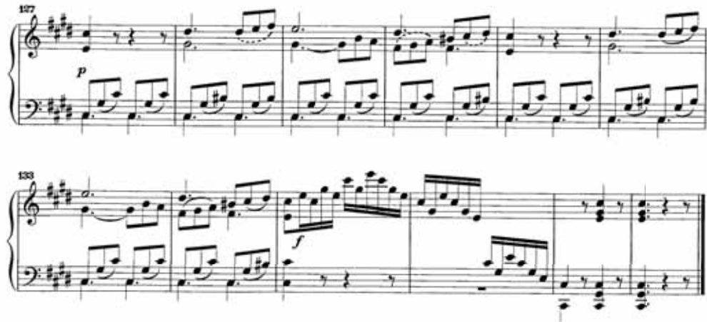
Ex. 32: Jadin, Sonata in C sharp minor, Op. 4, no. 3, 3rd movement, bars 127–138