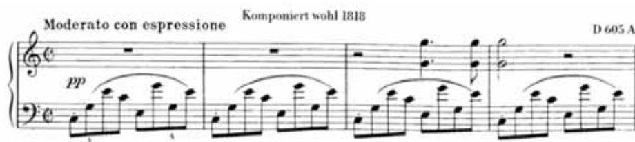
Ex. 98, Schubert, Grazer Fantasie, D 605a, 1–4

Proof that Schubert was already using the pedal in this way can be found in the introduction of his Grazer Fantasie, D 605a, (see Ex. 98) where the use of pedal is more or less obligatory as it is written in Nocturne style. 93