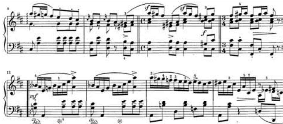
Ex. 147: Schumann, Papillons Op. 2, no. 11, bars 8–15

One similar dab of pedal was used for each of the slurs in bars 9–10 (see Ex. 147) to shape the slur and enhance the legato . Here again, Schumann’s indicated pedalling over fast passage-work did not sound blurred as it would on a modern piano, (see Ex. 147, bars 12–13).