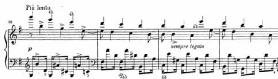
Ex.148: Schumann, Papillons Op. 2, no. 11, bars 32–35

Schumann seems to have notated only the unusual pedalling in bar 33 (see Ex 148). I assumed that ‘normal’ pedalling, with changes on each harmony, would be required in the più lento passage; in fact, this passage implies legato-pedalling from one beat to the next. I found in performance, however, that due to the higher register of the writing here, there was actually no difference in sound whether the pedal was changed or not.