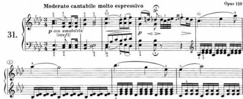
Ex. 99: Beethoven, Sonata in A flat, Op. 110, 1st movement, bars 1–8

greater range but were of a heavier construction, with a slightly longer after-ring, and pedals instead of knee-levers; I therefore chose to play it on the Graf replica. 94