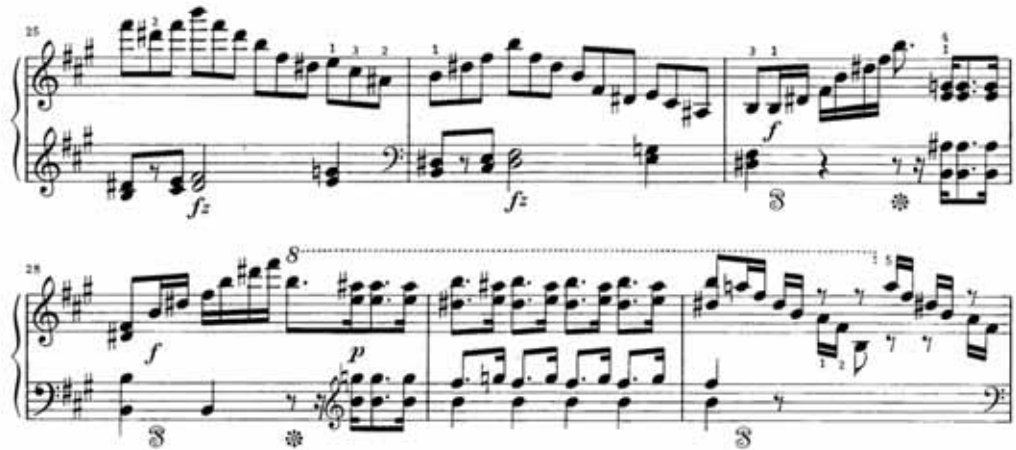
Ex. 36: Field, Sonata in A, Op. 1, no. 2, 1st movement, bars 25–30

There are some instances where the pedal was marked after the first beat and could have been interpreted as careless notation by the composer or a mistake on the part of the editor. However, I found that on the Clementi piano, the passages at bars 27, 28 and 30 (see Ex. 36) were quite successful when performed exactly in accordance with the instructions in the score.