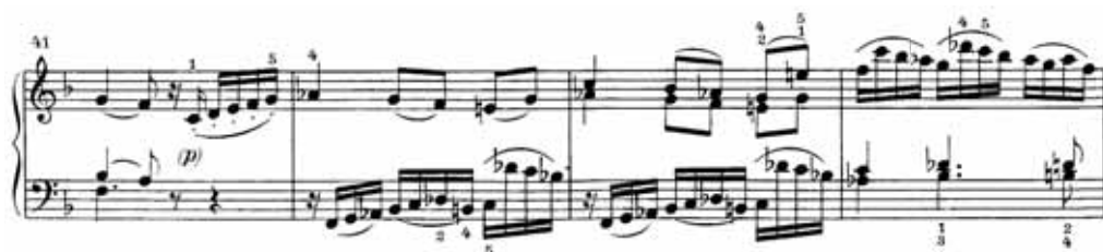
Ex. 57: Haydn, Sonata in C, Hob. XVI:50, 2nd movement, bars 41–44

The use of pedal also helped to create an expressive realisation of the distant and brooding F minor passage (see Ex. 57). I used rhythmic-pedalling, once per beat, but the combination of conjunct movement and a piano dynamic created a slight haze that simulated a 'register' effect similar to the open Pedal passages in the first movement.