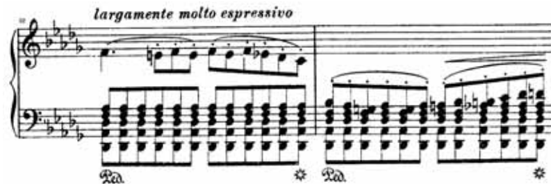
Ex. 127: Liszt, 12 Grandes Etudes, no. 9, bars 52–53

bar-line was definitely reflected in Liszt's teaching: "His students were encouraged to look beyond the bar line, and to consider a musical phrase as similar to a spoken one." 117 It therefore seems safe to assume that legato-pedalling went hand in hand with the development of longer phrases.