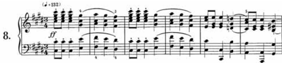
Ex. 142: Schumann, Papillons Op. 2, no. 8, bars 1–6

Although legato-pedal was employed elsewhere, I found that in No. 8, the chords under the slurs (see Ex. 142, bars 1–4), needed only one pedal: quick pedal changes were not yet necessary on the pianos of the time.