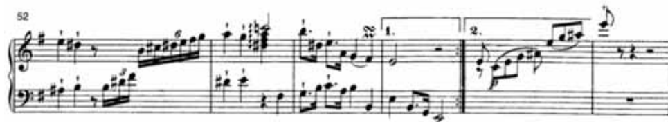
Ex. 2: C.P.E. Bach, Sonata in E minor, bars 52–56

Most of the remainder of the Fantasia is written in a highly articulate, rhetorical style, and therefore very little use of the knee lever was necessary or appropriate. This was also the case with the Sonata in E minor, which was quite similar to the Fantasia, despite its more structured form. I found only some improvisatory passages in the second movement and a few flourishes in the third movement that required the effect of raised dampers. The first instance was in the slow cadenza-like flourishes in the second-time bar at the end of the first movement (see Ex. 2).