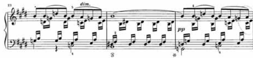
Ex. 130: Mendelssohn, Lieder ohne Worte, Op. 19, no. 1, bars 23–25

On closer inspection, however, the only two pedal indications suggest that Mendelssohn did not write this work with legato-pedalling in mind. The pedal indication in bar 24 (see Ex. 130) would otherwise be superfluous. I found in performance (as in the Liszt Etude Op. 1 no. 12) that the use of finger-legato throughout the melodic and bass-line slurs provided a satisfactory, flowing line; I pedalled here mainly for sonority, contrasting this with transparency of the softer passages.