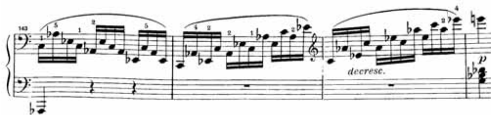
Ex. 6: Mozart Fantasia in C minor , K 475, bars 143–145

Another example of an extended arpeggio can be found in the Fantasia in C minor, K 475 (see Ex. 6), where Mozart surely intended the pedal to be held from the first beat of bar 143 through to the end of bar 145. This is similar to bars 9–11 of the Fantasia in D minor (see Ex. 4), although in the D minor Fantasia, bar 11 consists of a series of appoggiaturas, which were included in the general wash of sound.