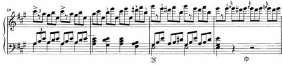
Ex. 35: Field, Field, Sonata in A, Op. 1, no. 2, 1st movement, bars 18–21

There are some instances where the pedal was marked after the first beat and could have been interpreted as careless notation by the composer or a mistake on the part of the editor. However, I found that on the Clementi piano, the passages at bars 27, 28 and 30 (see Ex. 36) were quite successful when performed exactly in accordance with the instructions in the score.