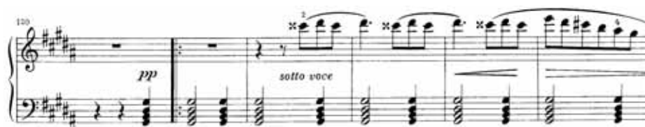
Ex. 92: Voříšek, Impromptu in B, Op. 7, no. 6, bars 120–125

At first I considered playing the trio of the sixth impromptu (see Ex. 92) with a long pedal to create an atmospheric haze, but I later decided that this could not be Voříšek's intention, or he would have written a long pedal as he did in the fifth impromptu. Here again I found that rhythmic-peddalling on the first beat minims produced a dance-like lilt and gave the music its appropriate character.