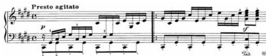
Ex. 70: Beethoven, Sonata in C sharp minor, Op. 27, no. 2, 3rd movement. bars 1–2.

The third movement is full of short pedal indications, for example in bar 2 (see Ex. 70), where Beethoven requires the use of pedal to create a dynamic surprise. The dynamic range on the pianos available to Beethoven was much narrower than on the modern grand pianos, so in this situation the pedal became an important tool. This type of pedalling was noted by Francesco Pollini (1762–1846) in his piano method (1812), where he states that the pedal can enhance accentuation and produce a larger and more noticeable forte or sforzato . 79