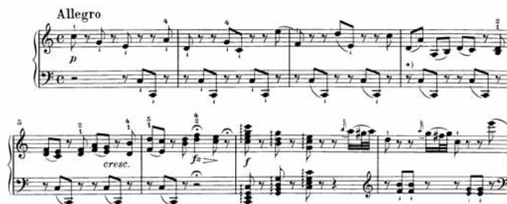
Ex. 50: Haydn, Sonata in C, Hob. XVI:50, 1st movement, bars 1–8

The two-note slurs in bars 2–3 override the weak-strong metre for a bar, the descending sevenths creating a moment of poignant expression. The thickly scored, arpeggiated chords in bar 6 also appear in the score as though they will sound short and clipped, but in actual fact, on the Clementi piano they sounded almost orchestral with their rounded, full tone negating the need for pedal. Haydn’s attempt to imitate the “Viennese” style becomes less apparent as the work progresses, however, and his writing adapts to the richer resonance of the English piano. One could even be forgiven for interpreting the opening bars as an example of the humour for which he is so well known. On every repetition of the theme in this monothematic sonata-form movement, the texture is less ‘dry’ until, at the climax of the development (the first indication of open Pedal ), 60 the theme is presented in a mystical way, in A flat major with pianissimo dynamics (see Ex. 51).