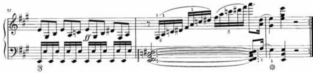
Ex. 38: Field, Sonata in A, Op. 1, no. 2, 1st movement, bars 57–59

The second subject opens with the pedal technique already found in the Jadin Sonata in C sharp minor, Op. 4, no. 3, where a low bass note is sustained under chords in a higher register (see Ex. 37, bars 33–34). The end of the exposition concludes with a crescendo through a broken-octave bass, followed by a rolled chord and a fast right hand arpeggio; here the long pedal marking was effective despite the blurred harmonies in bar 57 (see Ex. 38).