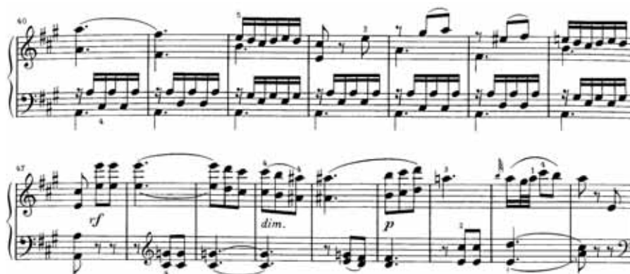
Ex. 25: Clementi, Sonata in F sharp minor, Op. 25, no. 5, 3rd movement, bars 40–55

and noble style of performance”, 35 which is an apt description of the second movement. It was interesting to discover, when rehearsing on a Viennese instrument, that the bass octaves in bars 14 and 16 (see Ex. 24) were rather ‘clipped’ in sound without the help of the pedal, but when performing on the Clementi piano, the long resonance of the bass meant that the gaps between the bass chords as the hand moves from one register to the next were almost inaudible. The second subject of the third movement is more melodic in character (see Ex. 25), and touches of pedal were used through the slurred octaves of the right hand to enhance the legato touch.