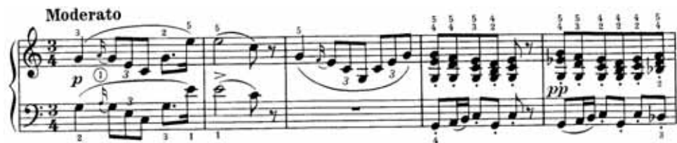
Ex. 93: Schubert, Moments musicaux no. 1, bars 1–5

According to Warmington, Schubert particularly appreciated and emulated Voříšek's style of piano writing. 91 The first of the Moments musicaux shares the key of C and the 'pastoral' nature with Voříšek's first impromptu, a similarity noted in Grove's Dictionary of Music and Musicians : "[Schubert's] 'Impromptus' and 'Moments musicaux' appear to be deeply influenced by Voříšek's 'Impromptus' Op. 7." 92 In the performance I found no need to pedal the main theme due to the articulate nature of the writing (see Ex. 93).