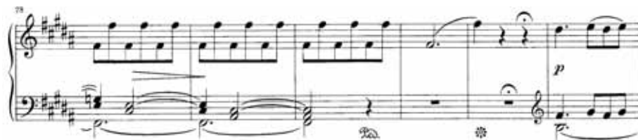
Ex. 91: Voříšek, Impromptu in B, Op. 7, no. 6, bars 78–83

texture and sonority rather than an isolated use of pedal, which by itself would hardly produce a notable effect.