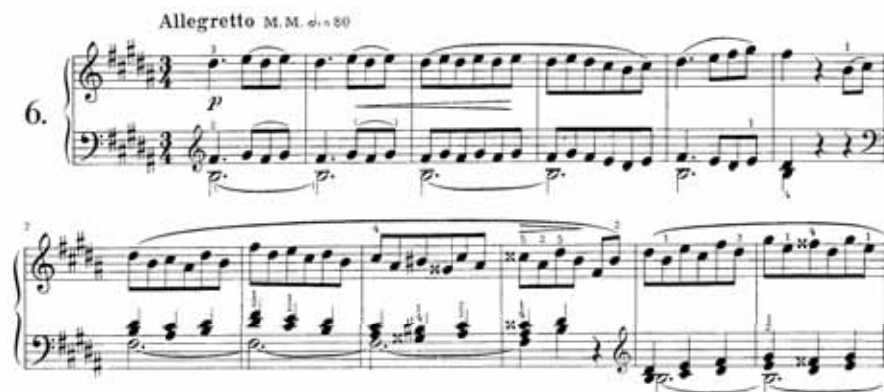
Ex. 89: Voříšek, Impromptu in B, Op. 7, no. 6, bars 1–12

The sixth impromptu seems to reflect Voříšek's professional work as an organist, because the opening (see Ex. 89) relies heavily on finger legato rather than on pedalling.