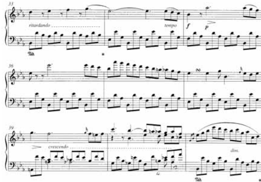
Ex. 120: Field, Nocturne no. 1 in E flat, bars 33–41

Field was obviously aware of passages that would not tolerate a pedalled sound due to conjunct movement and chromatic notes (see Ex. 121). In bars 62–63 his notation clearly indicates ‘finger-pedalling’, whereby the bass notes are sustained to alleviate the need for pedal as the harmonic rhythm and use of chromaticism increase. On the Clementi piano, there was little or no audible difference between passages played with and without pedal when ‘finger-pedalling’ was employed.