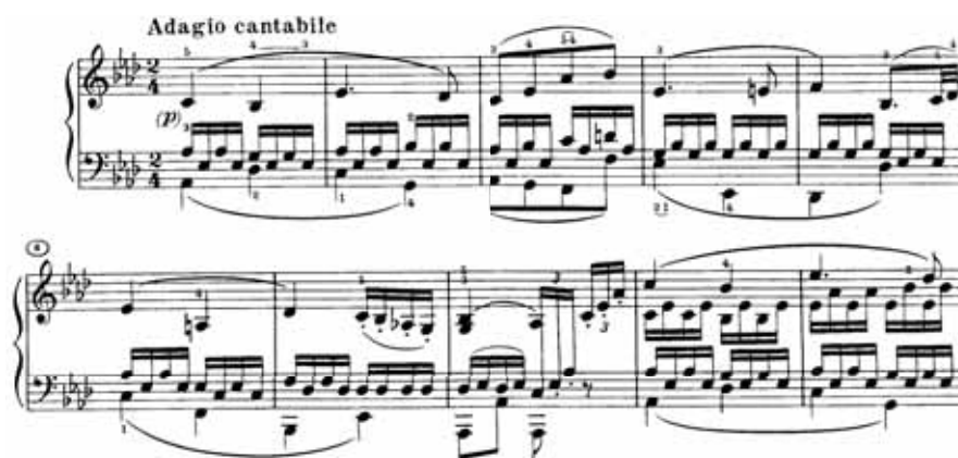
Ex. 66: Beethoven, Sonata in C minor, Op. 13, Pathétique , 2nd movement, bars 1–10

It is also well documented that Beethoven admired the works of Clementi, Dussek and Cramer, and that the influence of their works on his composition is considerable. It therefore seems likely that, like the English composers, he would have used the pedal regularly through cantabile passages. The main theme of the second movement is a cantabile melodic line (see Ex. 66), with an abundance of long legato slurs of irregular lengths. This unusual phrasing (with bass and treble slurs of different lengths) is important: the combination of emphasis on the start of each slur with a diminuendo at the end of each slur added shape to the phrases, even though I used rhythmic-pedalling throughout this theme. In this instance, the pedal creates a warm tone, blending the sounds of the bass line and accompanying broken chords, yet the short length of tone on the Walter piano allowed clarity of texture to prevail.