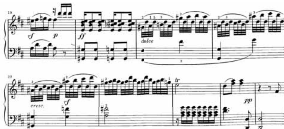
Ex. 23: Clementi, Sonata in F sharp minor, Op. 25, no. 5, 2nd movement, bars 19–27

Both the first and second movements have rinforzando markings, and I understood these to indicate moments of great expression. I included small crescendi and diminuendi and played with a legatissimo touch at these points in the performance in order to underline the expressive nature of the movement without the use of pedal. Neither was it found necessary to use the pedal for resonance or volume in the fortissimo passage, bar 19 (see Ex. 23). Bars 21–22 however were pedalled to achieve the legato slurs of the left hand. (This is in keeping with the fact that Clementi's first pedal markings were in dolce passages.) The pedal was also used to create a full sound during the cadential trill (bar 25).