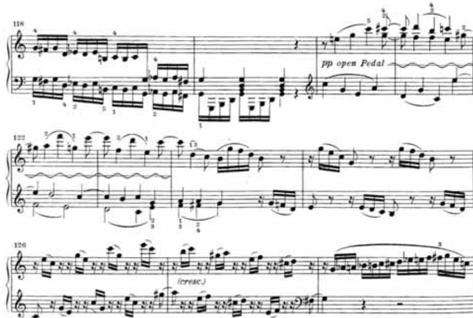
Ex. 52: Haydn, Sonata in C, Hob. XVI:50, 1st movement, bars 118–128

perhaps in imitation of a pantalon or music box. The use of pedal to create such an effect is not unusual, as similar passages are also found in works of Clementi and Dussek. Bart van Oort even goes so far as to suggest that this passage “is easier to understand as Haydn’s adoption of an existing English stereotype: a sound effect easily recognizable to his English audience.” 61