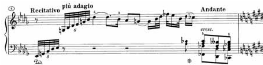
Ex. 105: Beethoven, Sonata in A flat, Op. 110, 3rd movement, bar 4

modern style of constant, but discreet pedalling. In my opinion, his pedalling was still rather ‘rough’ in modern terms. This can be inferred by the notation that does exist, especially in his continued use of longer pedals in the third movement. One such example is where he employed it as a special, registral effect in the recitativo of the 3 rd movement at bar 4 (see Ex. 105).