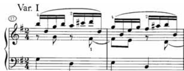
Ex. 13: Mozart, Sonata for Piano and Violin in G, K 379, 2nd movement, bars 17–18

In the second movement, the solo piano variation does seem dependent on the use of pedal to sustain some of the bass notes. In bar 17 (see Ex. 13), it is difficult for most pianists to sustain the bass D whilst playing the F sharp without the use of pedal. 22