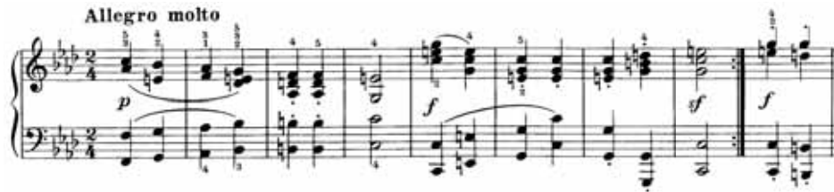
Ex. 103: Beethoven, Sonata in A flat, Op. 110, 2nd movement, bars 1–9

Even though the pedal was never used specifically as a tool to enable or assist legato playing — and Beethoven was particularly renowned for his finger legato — the use of pedal in bars 5–6 of the second movement to enhance the forte , (see Ex. 103) has a valuable bi-product in that it connects the notes under the left hand slur as well.