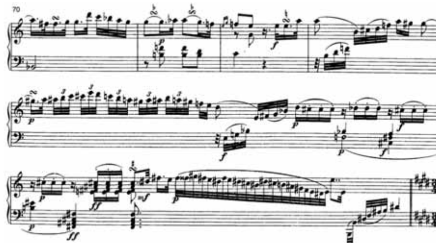
Ex. 3: C.P.E. Bach, Sonata in E minor, bar 70–73

At the end of the second movement, a cadenza-like passage suggested the use of raised dampers (see Ex. 3, bar 73). The alternating piano and forte chord passage at the end of the 2nd line (which is similar to a passage in the Fantasia) was surprisingly effective when played without clearing the pedalled sound on this Stein instrument. Despite the changing harmonies, I interpreted the unusual slur at this point to have some meaning, and as it is obviously not possible to join these left hand chords with the fingers; perhaps Bach did have in mind raised dampers here.