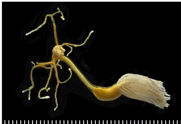
Figure 3 Lernaelophus sultanus (Copepoda, Pennellidae), specimen BMNH 2010.750, from Pristipomoides filamentosus off New Caledonia. Scale, each scale division = 1 mm.

Ancyrocephalids included a series of species of the recently described genus Haliotrematoides Kritsky, Yang & Sun, 2009, several species of Euryhaliotrema Kritsky & Boeger, 2002, which are still undescribed, and we also have records of various ancyrocephalids not attributed to a genus. Clearly, the lutjanids harbour an impressive ancyrocephalid radiation, with probably several species