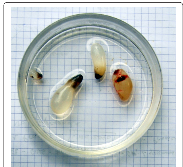
Figure 4 Sterile cysts from deep-sea lutjanids (here from Pristipomoides auricilla ), interpreted as immature cysts of trypanorhynch cestodes. Scale, each square = 5 mm.

Adult anisakids included two newly described species of Raphidascaris ( Ichthyascaris ), one from the coral-