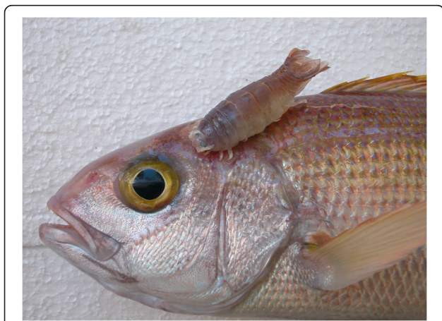
Figure 1 Anilocra gigantea (Isopoda, Cymothoidae), specimen MNHN Is6292, on the deep-sea lutjanid Pristipomoides filamentosus .

Larval isopods belonged to the Gnathiidae. Gnathiids, found as praniza larvae, were collected on 6 species of nemipterids and lutjanids (5 reef-dwelling, 1 deep water). In New Caledonia, larval gnathiids were found on most fish families examined (serranids, lethrinids, lutjanids, nemipterids and many others). Adult isopods were found on serranids and lutjanids but not on lethrinids and nemipterids [7,8]. The biodiversity of larval gnathiids is hard to evaluate [34,35], but it is likely that several species are involved.