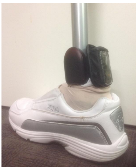
Figure 1. The SAM and GPS devices attached to a prosthesis for data collection. The SAM was positioned according to the manufacturers' recommendations. The GPS was attached to the same strap as the SAM device for convenience.

A QStarz BT-Q1000XT (Qstarz International Co., Ltd., Taipei, Taiwan) 66-channel tracking global positioning system (GPS) travel recorder was used to record latitude, longitude, local date and time of each participant's position for every five seconds of programmed use. The device measures 7.2 cm × 4.7 cm × 2.0 cm, has a battery life of 42 h and accuracy error of less than three metres. Data from the GPS unit were imported to QTravel software (version 1.46) and stored within the software database.