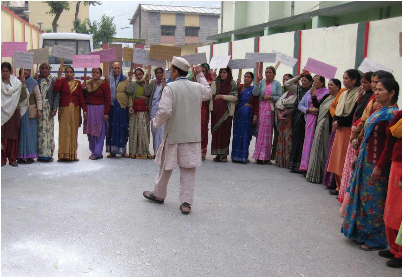
FIGURE 3 Man leading a rally during a “Save the Ganga” campaign.

worried that the Ecologically Sensitive Zone he campaigned for would also lead to the creation of a conservation zone that would leave little room for mountain residents to demand and realize regionally appropriate development measures such as microdams on small tributaries and other projects that could be designed with a lighter ecological footprint while promoting regional employment.