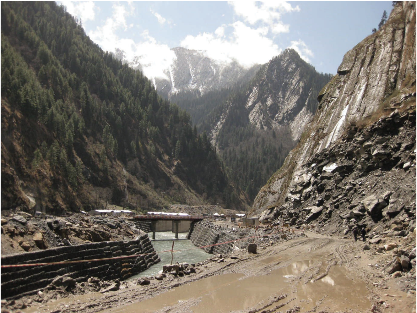
FIGURE 1 Road construction and water diversion for the Loharinag Pala Hydel project.

Sikkim (Chandy et al 2012). Some of the construction activities involved occasional roadblocks and other disturbances that hindered the flow of pilgrimages and tourism, a seasonal mainstay of the regional economy. Several fatal car accidents were also attributed to the hastily created infrastructure, including roads that crumbled under the weight of large vehicles. In 2009, a bus with schoolchildren, teachers, and villagers tumbled down a ravine near a dam construction site. Several other cars suffered similar fates, though it is difficult to tell whether the cause was the roads or the monsoon rains that chip away at the hillsides.