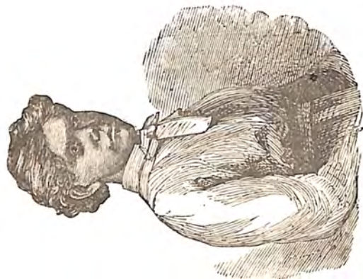
NATIVES EDUCATED AT POONINDIE, 1858.