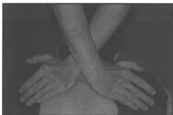
Fig.2. Single level thoracic manipulation (screw thrust technique) at both zygapophyseal joints of T6-T7