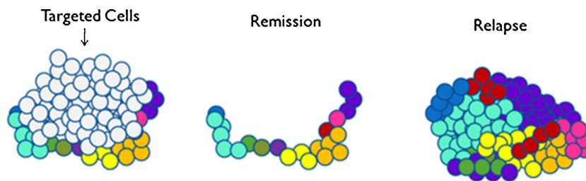
Fig. 1. Diagrammatic representation of removal of susceptible cells by a targeted cancer therapy resulting in disease remission, which leaves genetically heterogeneous resistant cells to proliferate, resulting in relapse.

many current targeted therapies and the personalized medicine paradigm. Molecular target therapies represent a significant advance in the treatment of cancer. They include drugs such as imatinib, an inhibitor of the tyrosine kinase enzyme BCR-ABL, which has made chronic myelogenous leukemia a more manageable disease, and inhibitors of vascular endothelial growth factor receptor (VEGFR), such as sunitinib, sorafenib and bevacizumab, used in renal and colon cancers [2]. Other important treatments based on tumor-specific targets are now in use, including examples such as epidermal growth factor receptor (EGFR) inhibitors (gefitinib, erlotinib) used in lung cancer, and the Her2 inhibitor trastuzumab used in breast cancer. Another approach is the synthetic lethal model [4] exemplified by research on poly ADP ribose polymerase (PARP) inhibition, in which mutational loss of one or more redundant components of a cell survival pathway in tumorigenic cells confers selective sensitivity to drugs that target remaining pathway components.